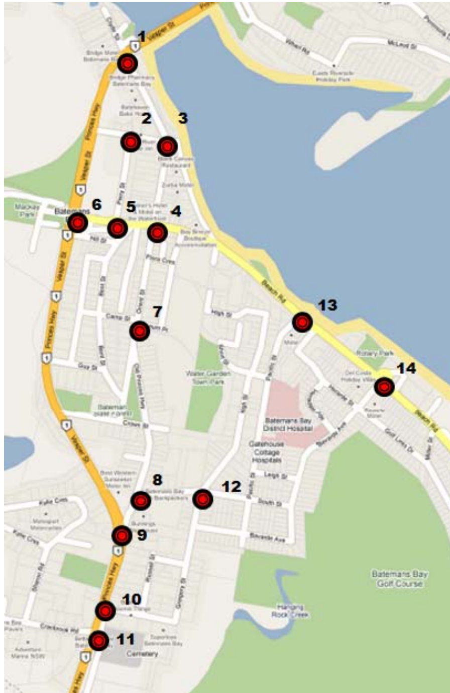
Figure 2: Traffic Count Locations

Appendix B contains the associated table for each count location for each period.