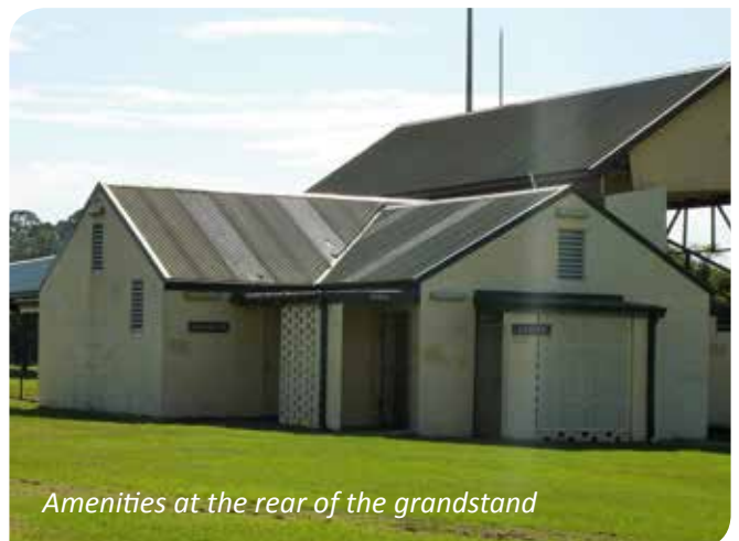
Amenities at the rear of the grandstand