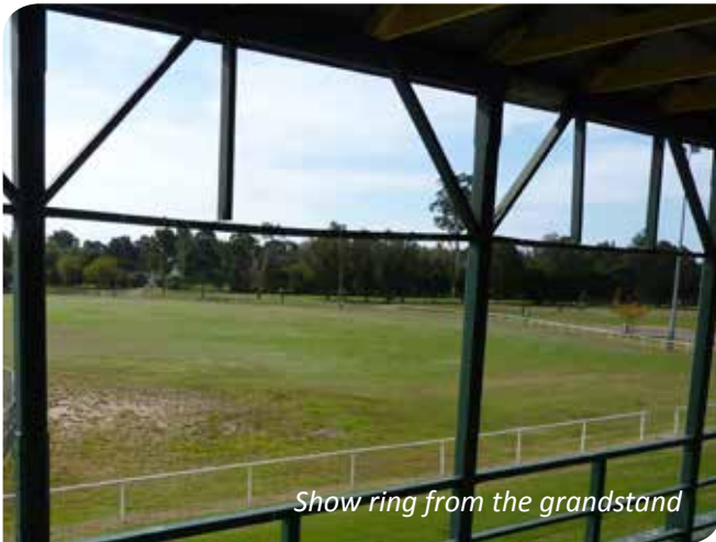
Show ring from the grandstand