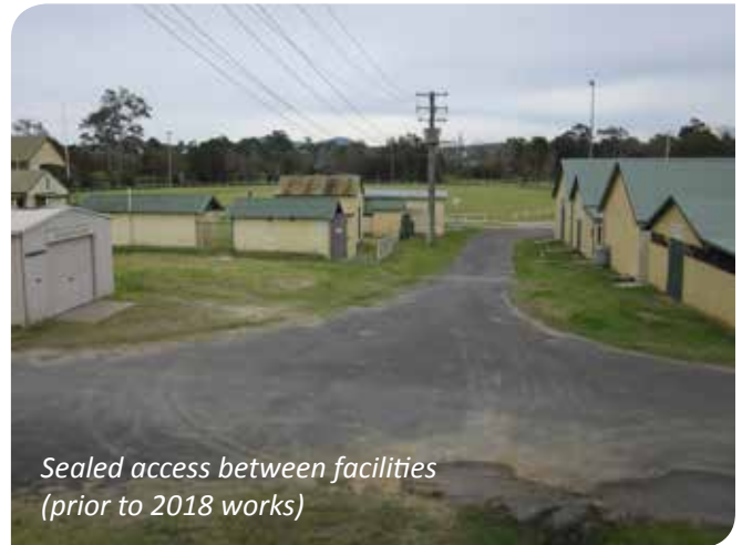
Sealed access between facilities (prior to 2018 works)