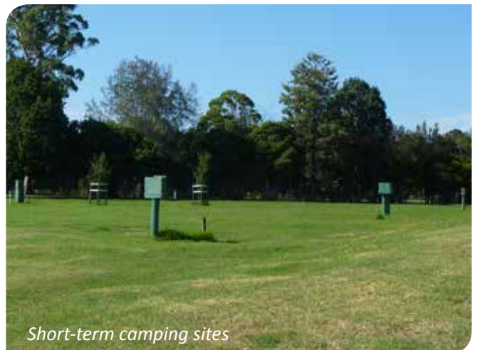
Short-term camping sites