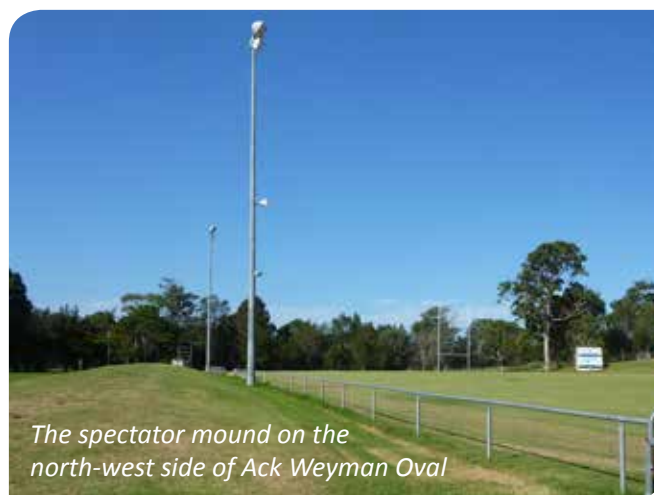
The spectator mound on the north-west side of Ack Weyman Oval