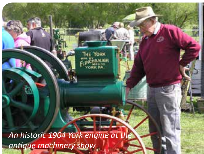
An historic 1904 York engine at the antique machinery show