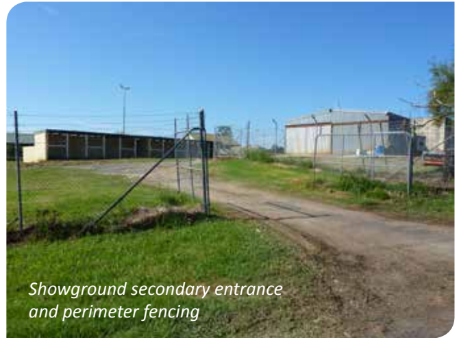
Showground secondary entrance and perimeter fencing