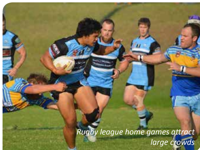
Rugby league home games attract large crowds