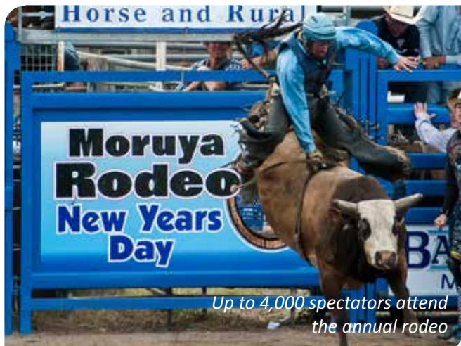
Up to 4,000 spectators attend the annual rodeo