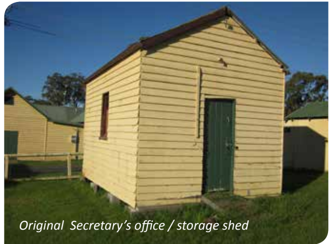
Original Secretary's office / storage shed