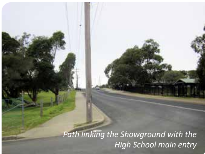
Path linking the Showground with the High School main entry