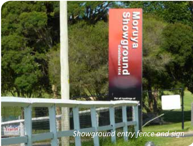
Showground entry fence and sign