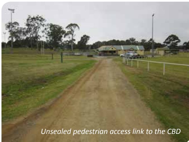
Unsealed pedestrian access link to the CBD