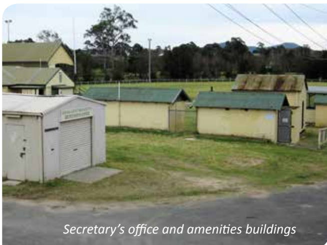
Secretary's office and amenities buildings