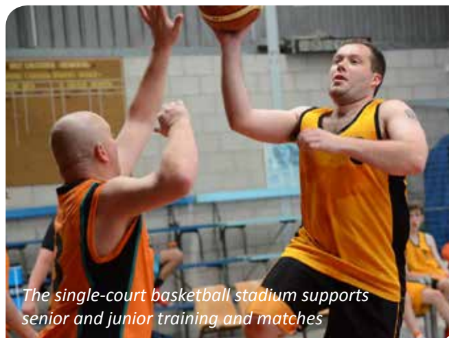
The single-court basketball stadium supports senior and junior training and matches