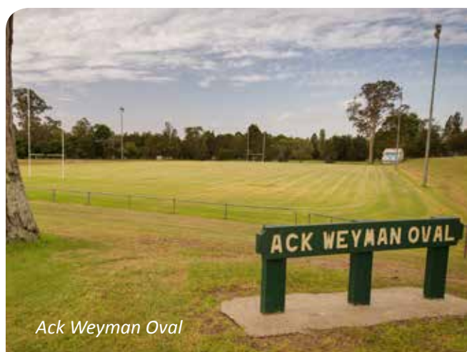
Ack Weyman Oval