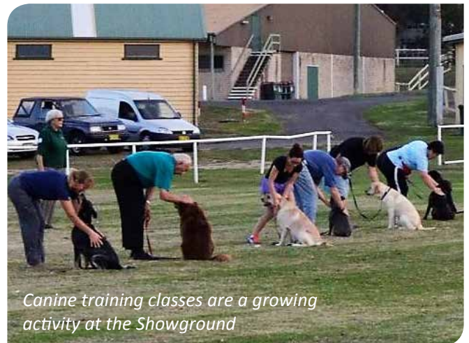
Canine training classes are a growing activity at the Showground