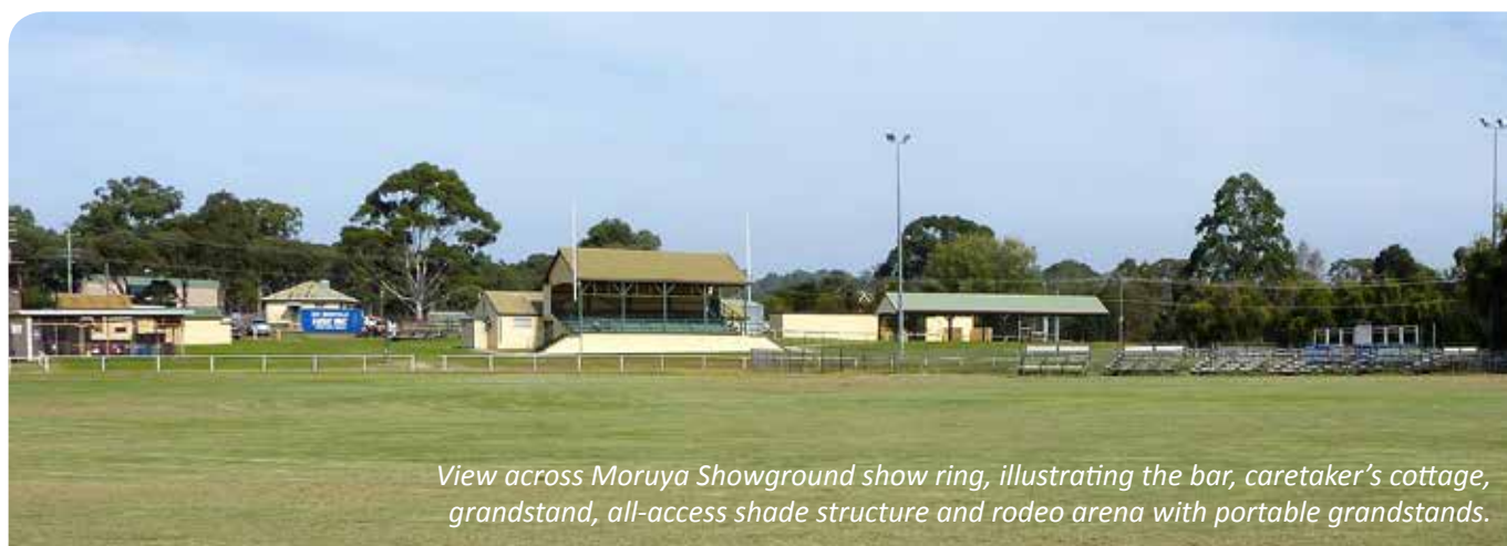
View across Moruya Showground show ring, illustrating the bar, caretaker's cottage, grandstand, all-access shade structure and rodeo arena with portable grandstands.

This Masterplan will be an essential tool in attracting external investment such as grant funds, recognising that neither Council nor the community possesses funds for all of the recommended capital improvement.