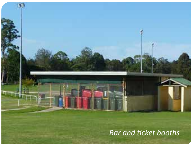
Bar and ticket booths