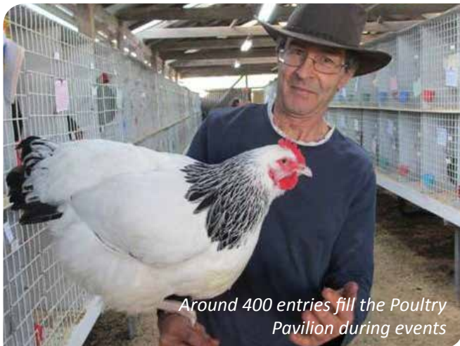
Around 400 entries fill the Poultry Pavilion during events