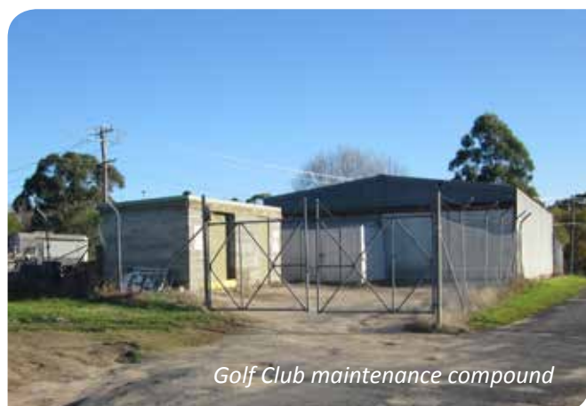
Golf Club maintenance compound