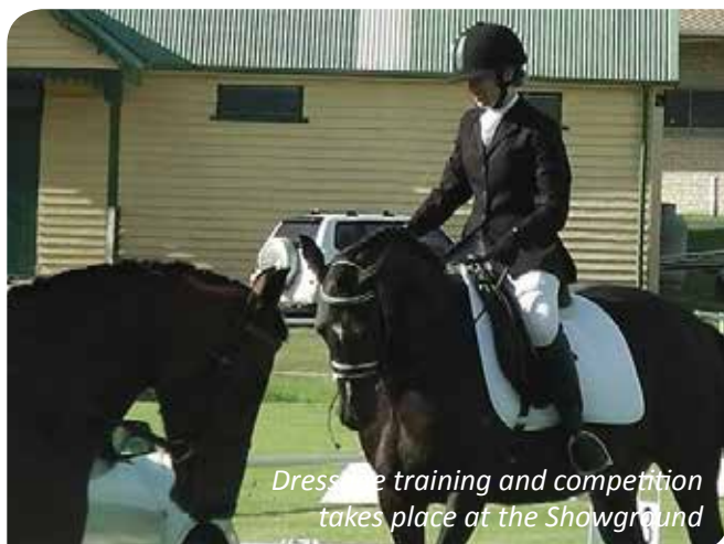
Dressage training and competition takes place at the Showground