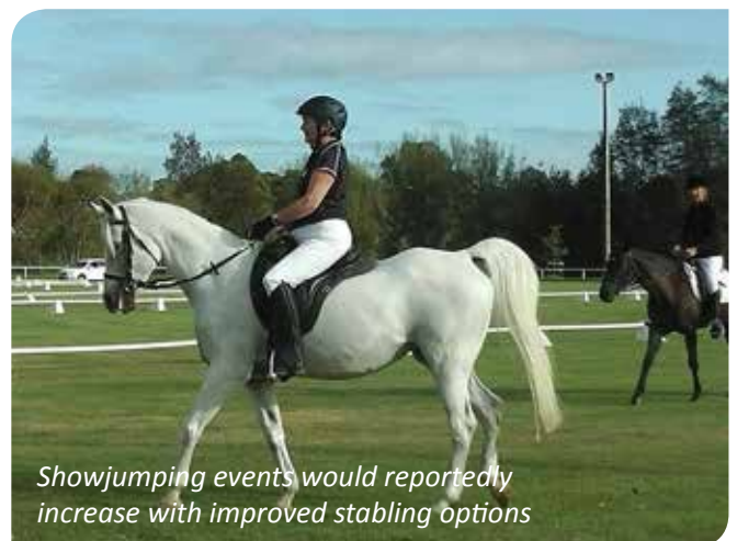
Showjumping events would reportedly increase with improved stabling options