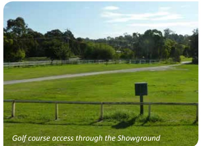
Golf course access through the Showground