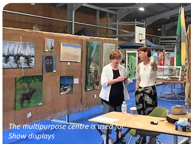
The multipurpose centre is used for Show displays