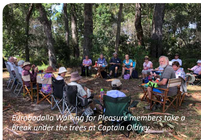
Eurobodalla Walking for Pleasure members take a break under the trees at Captain Oldrey.