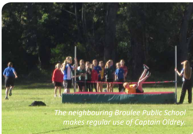
The neighbouring Broulee Public School makes regular use of Captain Oldrey.