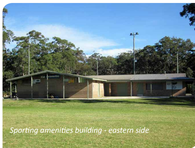
Sporting amenities building - eastern side