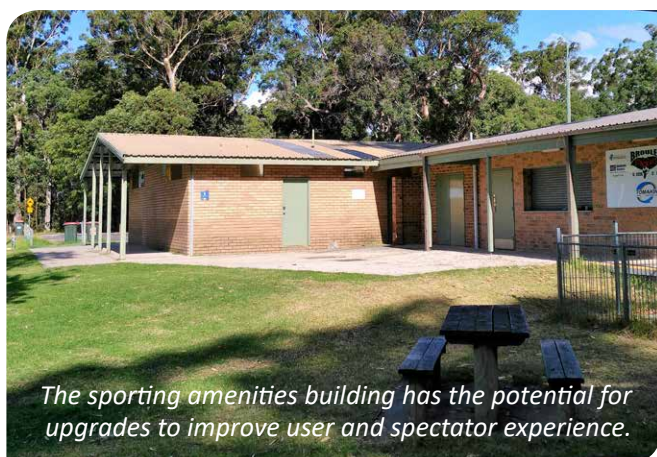
The sporting amenities building has the potential for upgrades to improve user and spectator experience.