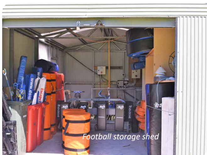
Football storage shed