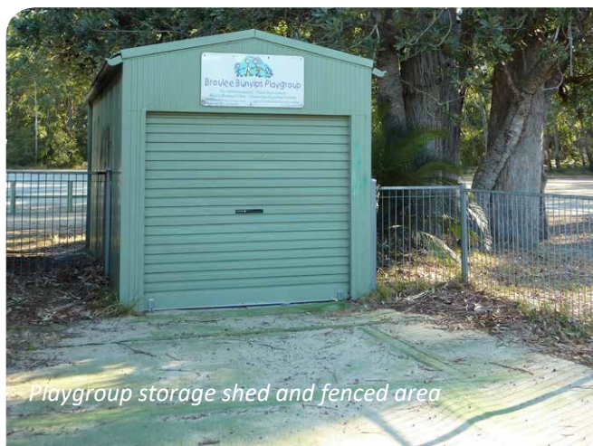
Playgroup storage shed and fenced area