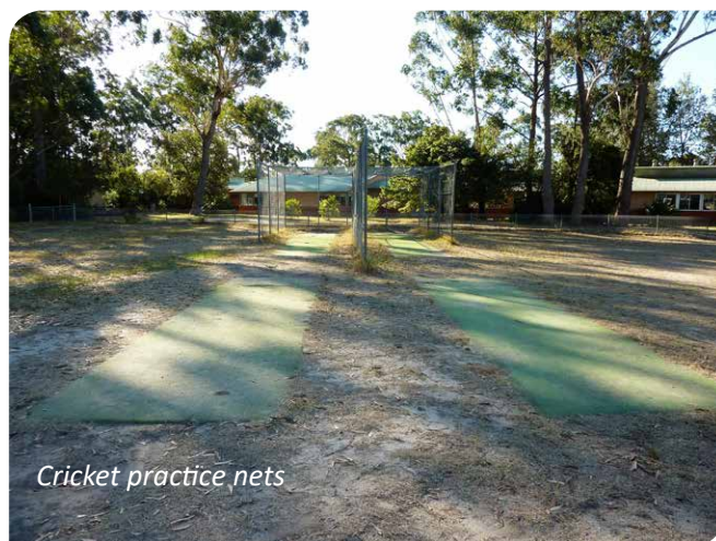
Cricket practice nets