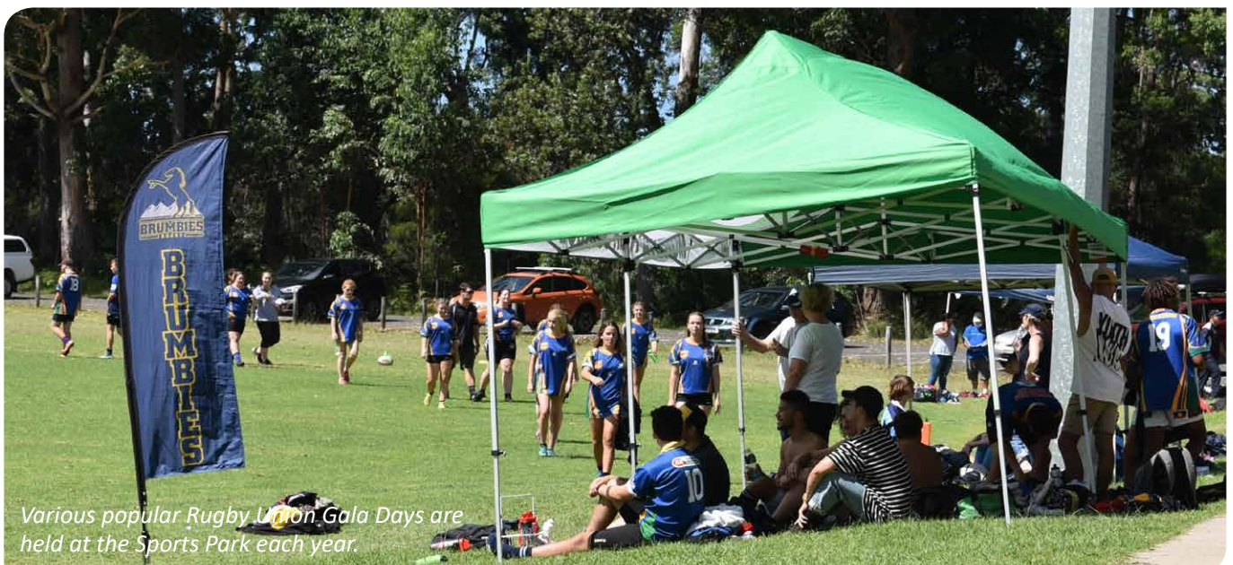
Various popular Rugby Union Gala Days are held at the Sports Park each year.

This Masterplan will be an essential tool in attracting external investment such as grant funds, recognising that neither Council nor the community possesses funds for all of the recommended capital improvements.