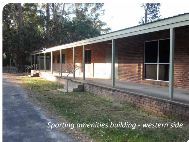
Sporting amenities building - western side