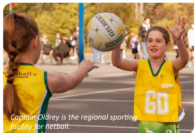
Captain Oldrey is the regional sporting facility for netball.