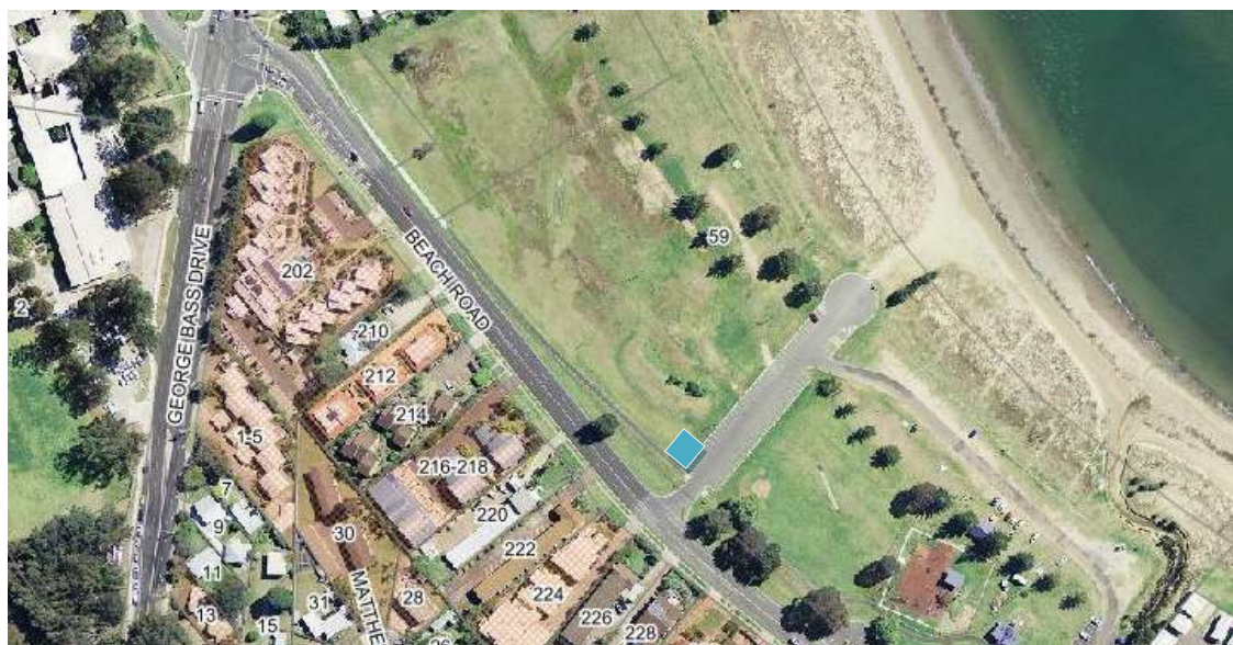
Reserve R66122 – Corrigans Beach, Batehaven

The licence area indicated in blue in the sketch below.