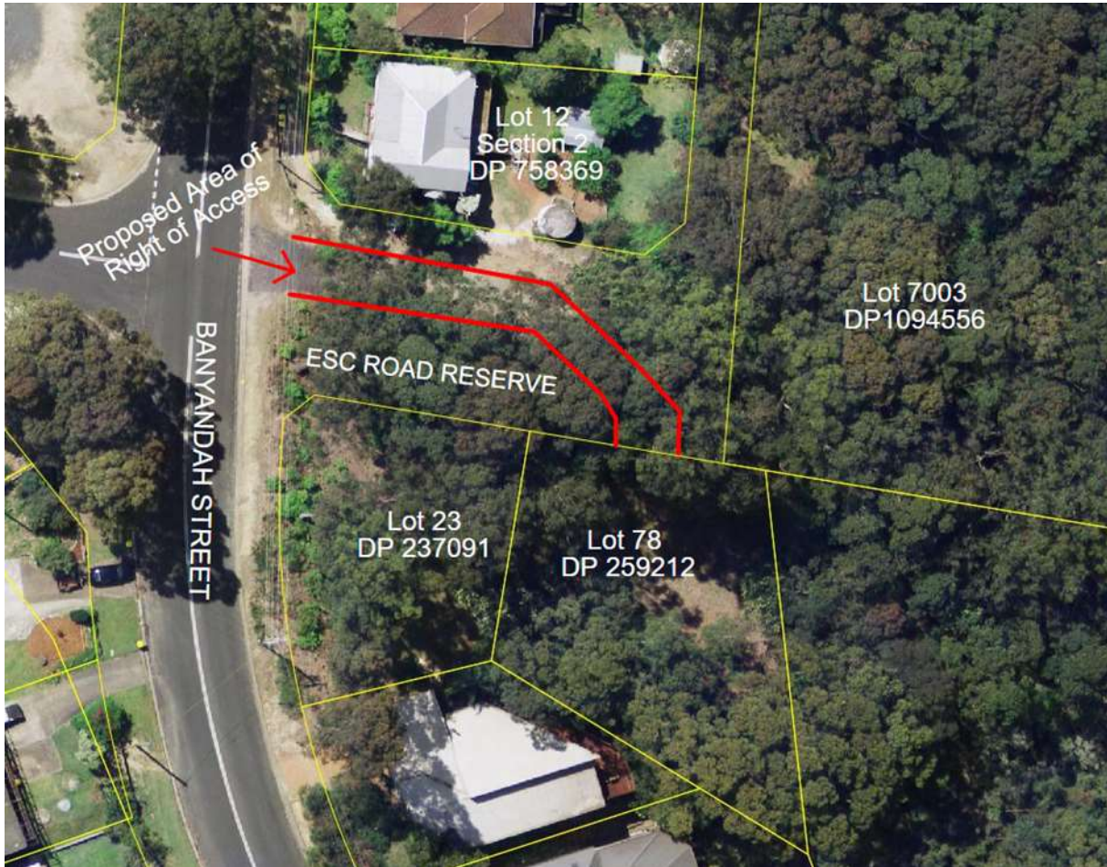
Lot 78 DP 259212 Banyandah Street, South Durras