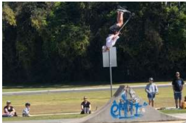
Skate park event (Action E27)