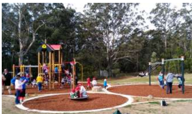
The new Mogo playground (Action N2)