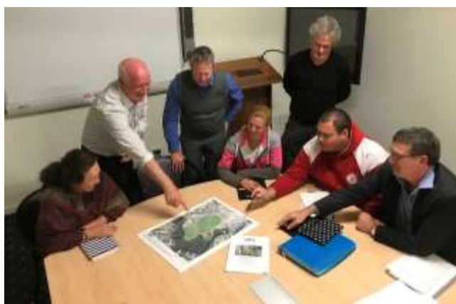
Stakeholder meeting for the Bill Smyth Oval landscape masterplan (Action S3)