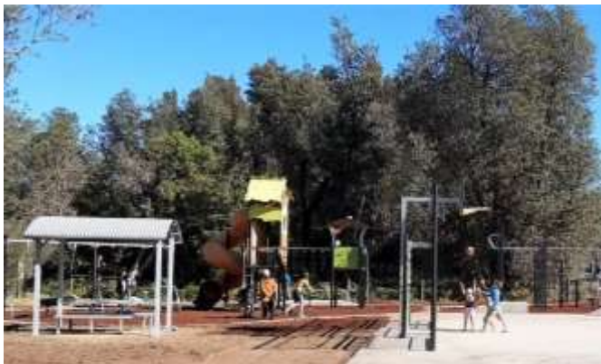
The new Long Beach Recreation Park (Action N8)