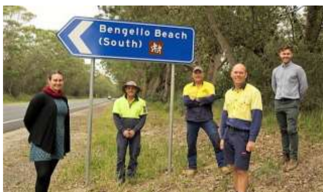
New signage installed consistent with the Tourism Wayfinding & Signage Strategy (Action E21)