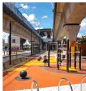
Youth Central will activate the hard space around and under the new bridge to be a place for youth with a range of outdoor recreational facilities and activities. Youth Central will be a connecting element linking the whole of the waterfront as a stronger, more attractive and safer place for all.