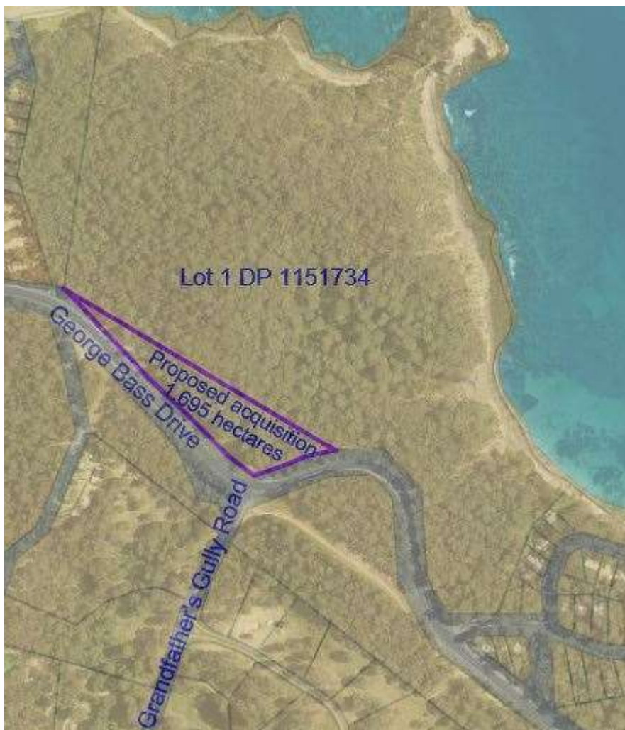
Lot 1 DP 1151734 – George Bass Drive, Lilli Pilli