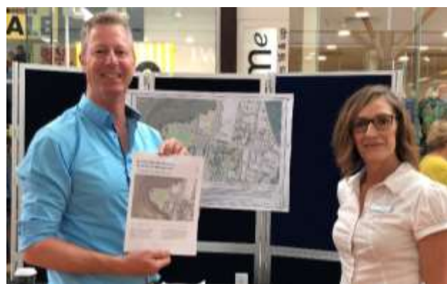
Mackay Park Plan of Management (Action E29)