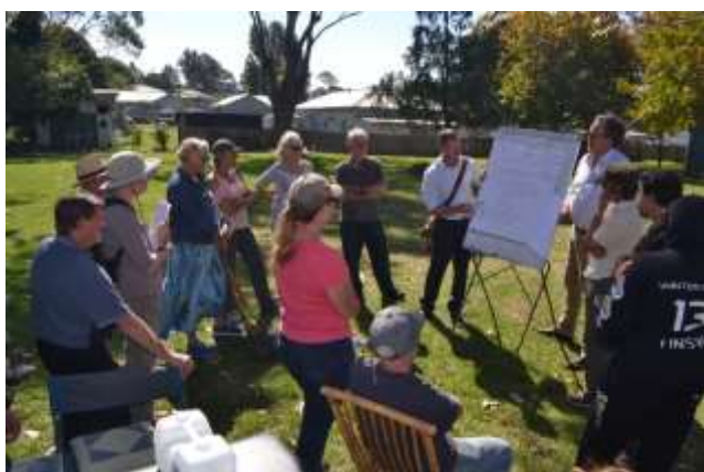
Community meeting to discuss the future of Walker Park (Action S8)