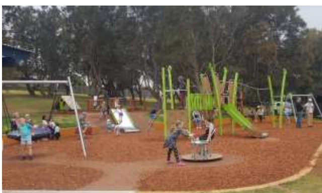
The new and upgraded playground at Evans Park in Tross Head (Action C11)