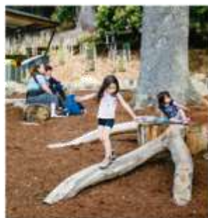
Upgrading the park with a theme based on nature play and exploration of the marine environment will encourage children and young people to make their own discoveries on their own terms and at their own pace. Views and accessibility to the park will increase with the upgrading of the waterfront and new bridge.