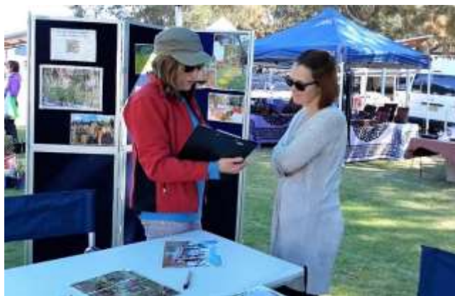
Gathering community input for the Tuross Head Evans Park upgrade (Action C11)