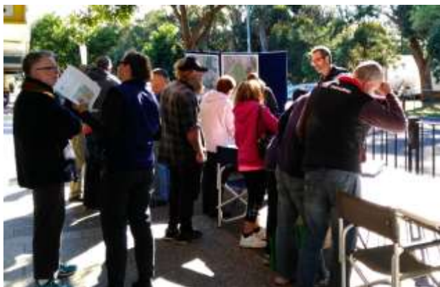
Street meet for the Narooma Sport and Leisure Precinct Plan of Management (Actions E29)