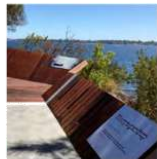
The stories of the waterfront underpin the identity of Batemans Bay. Story-telling opportunities include those of the Aboriginal community, the oyster industry, timber milling, past crossings of the Clyde and the fishing industry. These stories may be presented as stand-alone elements or as integrated features within the street furniture.