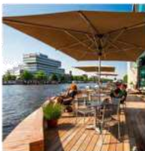
Redevelopment of the Smoke Point shed will create a new visitor and local hub with a restaurant/cafe, local tour ticket/booking office, interpretation and upgraded jetty for the oyster industry and recreational users. The development will also strengthen the interface with the Clyde River estuary.