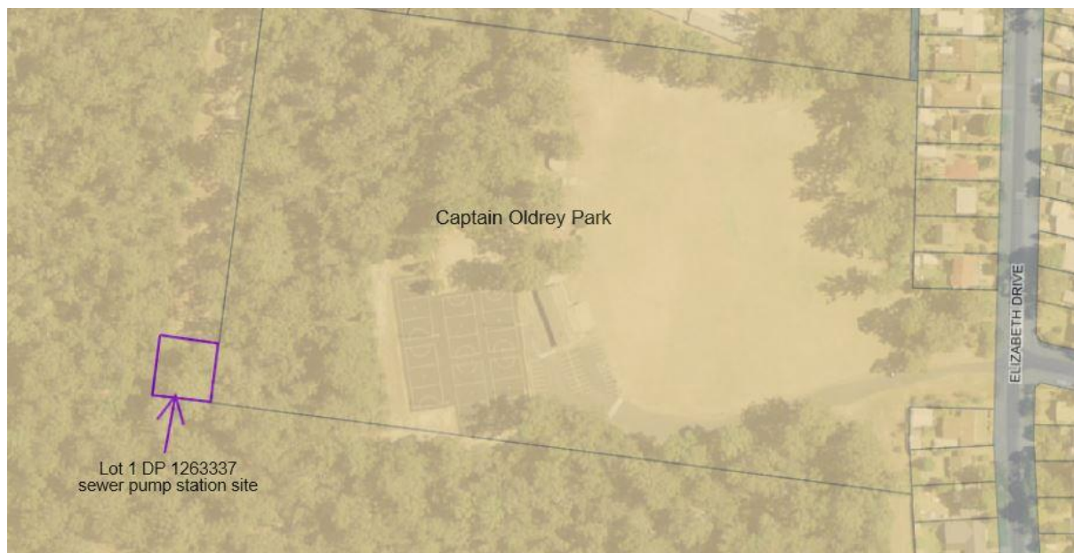
Lot 1 DP 1263337 - Broulee

The land to be classified as operational is shown in the diagram below.