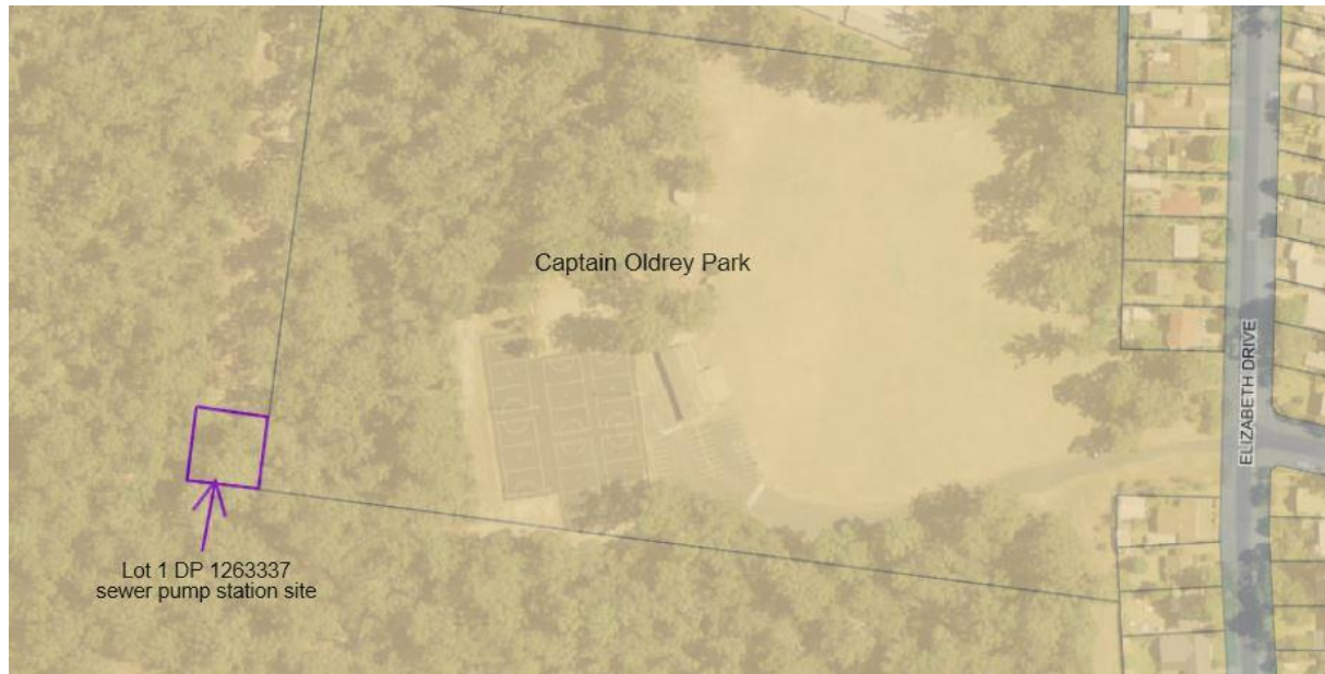
Lot 1 DP 1263337 - Broulee

The land to be classified as operational is shown in the diagram below.