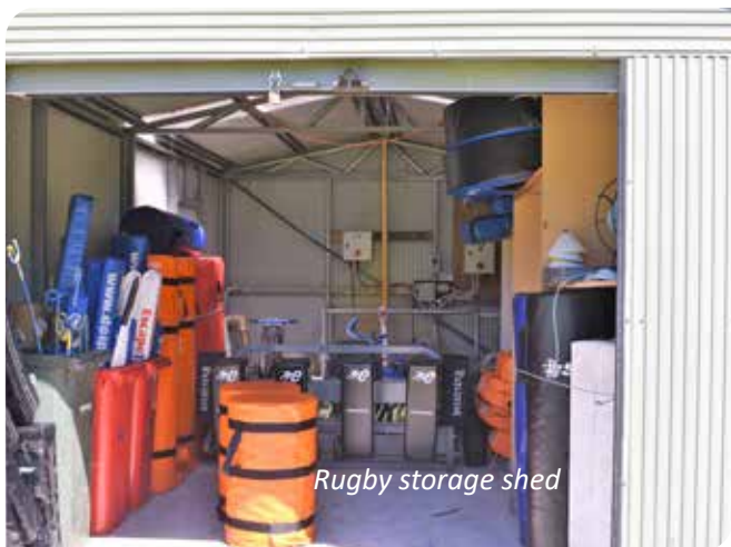
Rugby storage shed