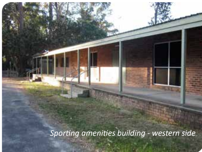
Sporting amenities building - western side