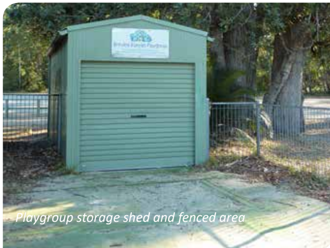
Playgroup storage shed and fenced area