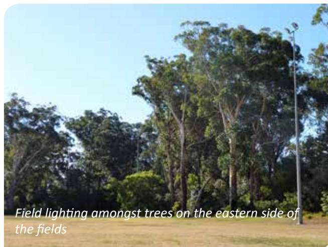
Field lighting amongst trees on the eastern side of the fields