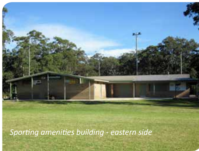
Sporting amenities building - eastern side