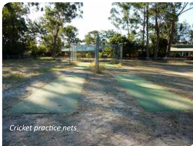
Cricket practice nets