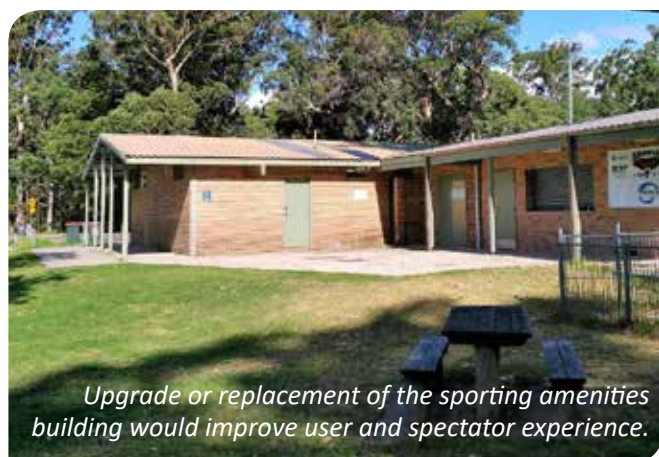
Upgrade or replacement of the sporting amenities building would improve user and spectator experience.