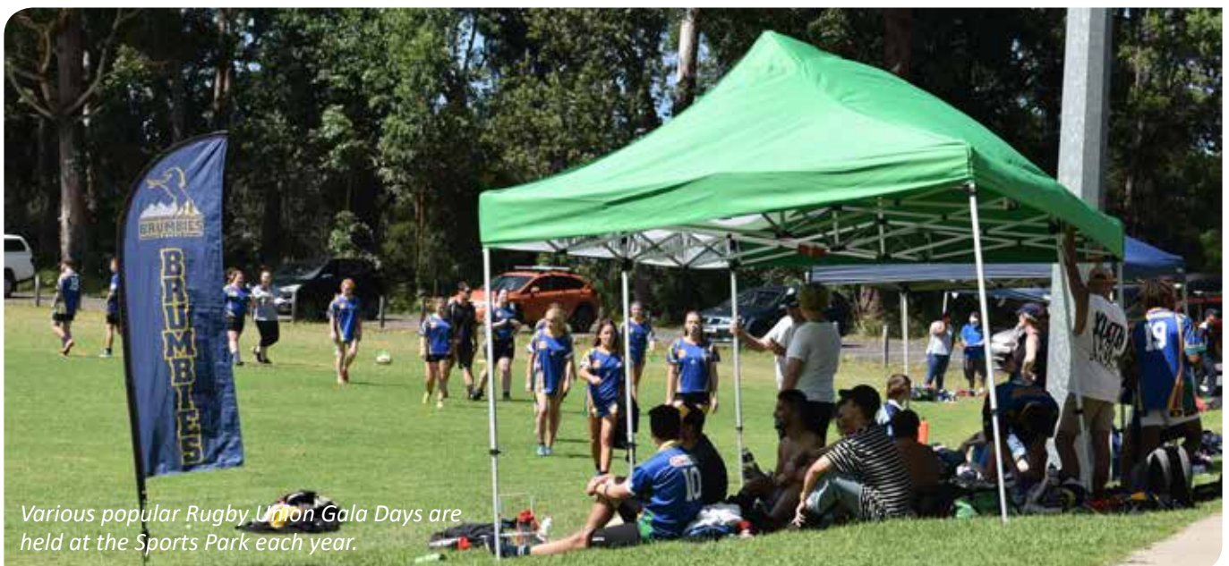
Various popular Rugby Union Gala Days are held at the Sports Park each year.

This Masterplan will be an essential tool in attracting external investment such as grant funds, recognising that neither Council nor the community possesses funds for all of the recommended capital improvements.