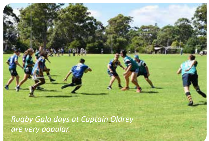
Rugby Gala days at Captain Oldrey are very popular.