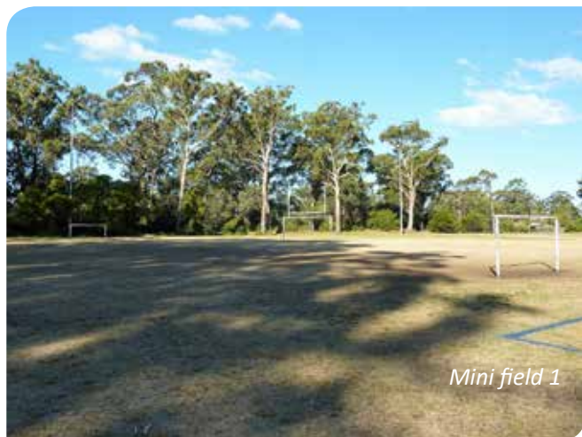
Mini field 1