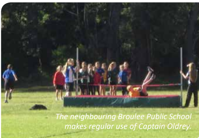
The neighbouring Broulee Public School makes regular use of Captain Oldrey.