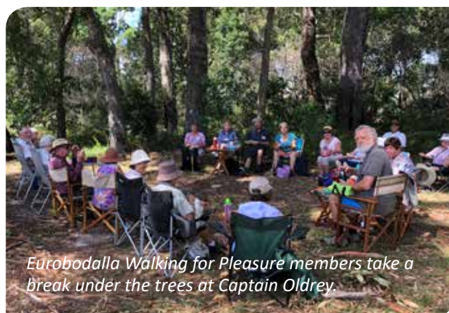
Eurobodalla Walking for Pleasure members take a break under the trees at Captain Oldrey.