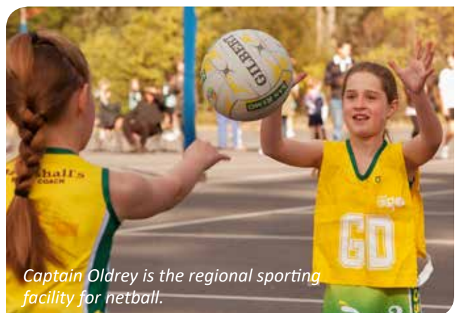
Captain Oldrey is the regional sporting facility for netball.