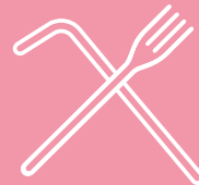
Refuse plastic straws and cutlery, carry your own