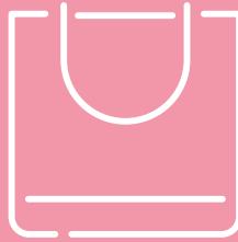
Carry a reusable shopping bag