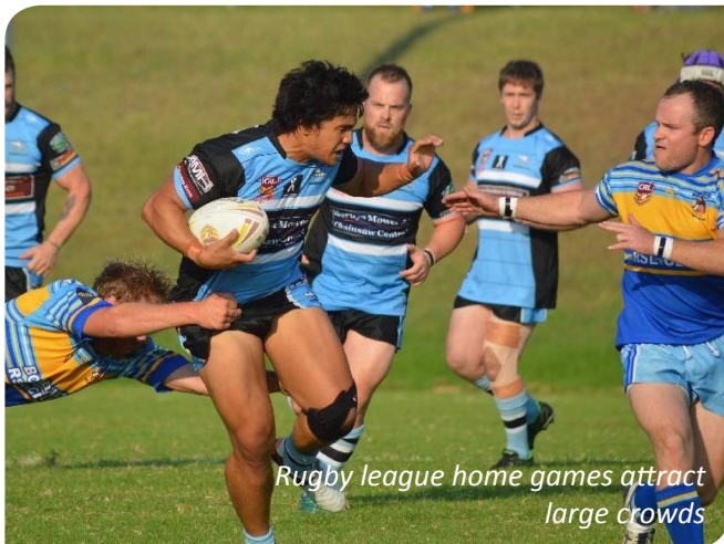
Rugby league home games attract large crowds