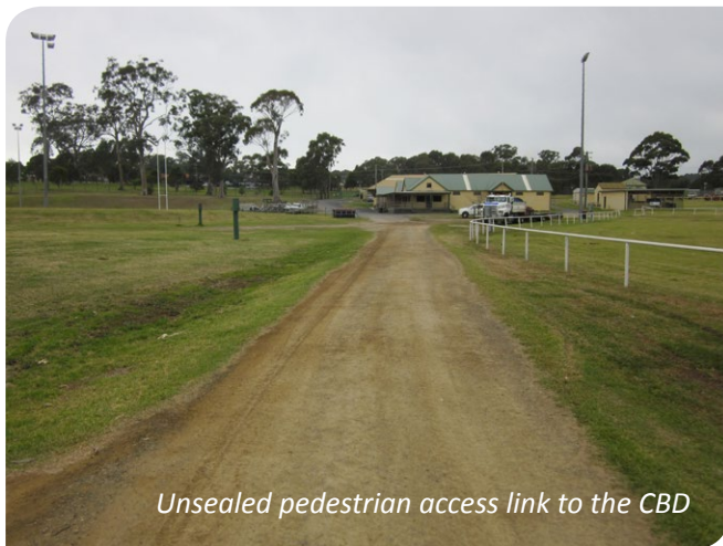
Unsealed pedestrian access link to the CBD