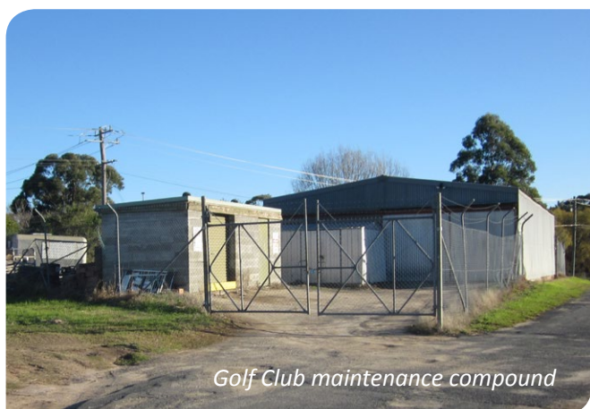
Golf Club maintenance compound