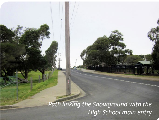
Path linking the Showground with the High School main entry