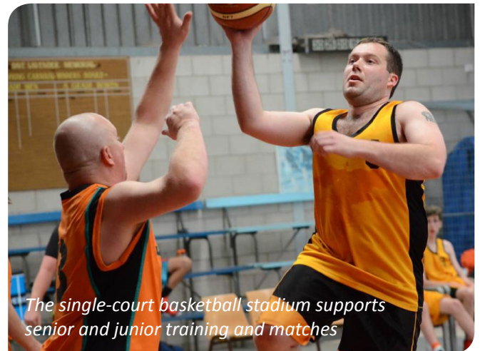
The single-court basketball stadium supports senior and junior training and matches