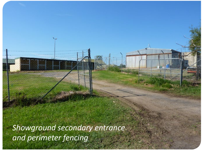
Showground secondary entrance and perimeter fencing