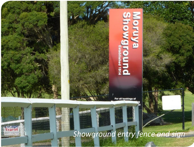
Showground entry fence and sign