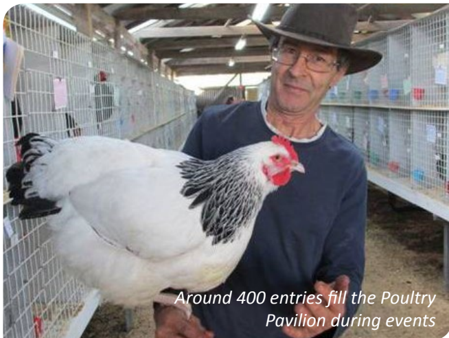
Around 400 entries fill the Poultry Pavilion during events