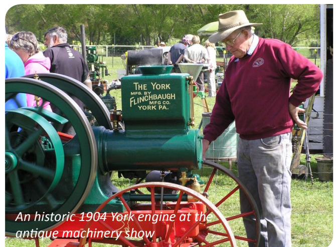
An historic 1904 York engine at the antique machinery show