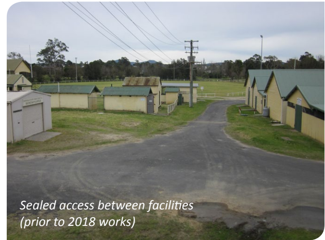
Sealed access between facilities (prior to 2018 works)