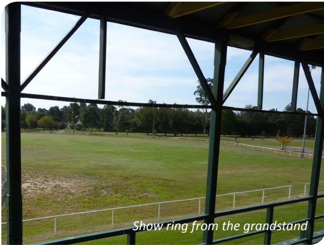
Show ring from the grandstand