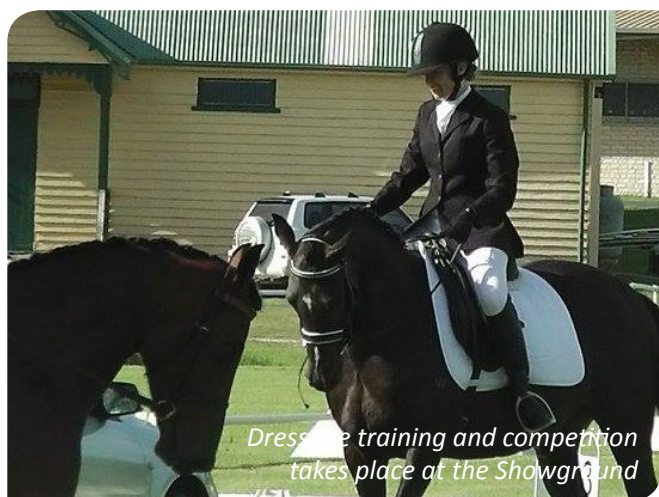
Dressage training and competition takes place at the Showground