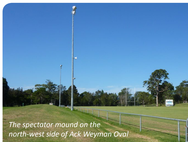
The spectator mound on the north-west side of Ack Weyman Oval