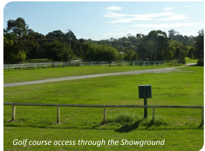
Golf course access through the Showground