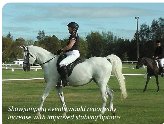
Showjumping events would reportedly increase with improved stabling options