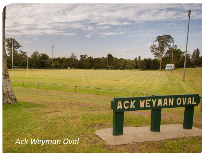
Ack Weyman Oval