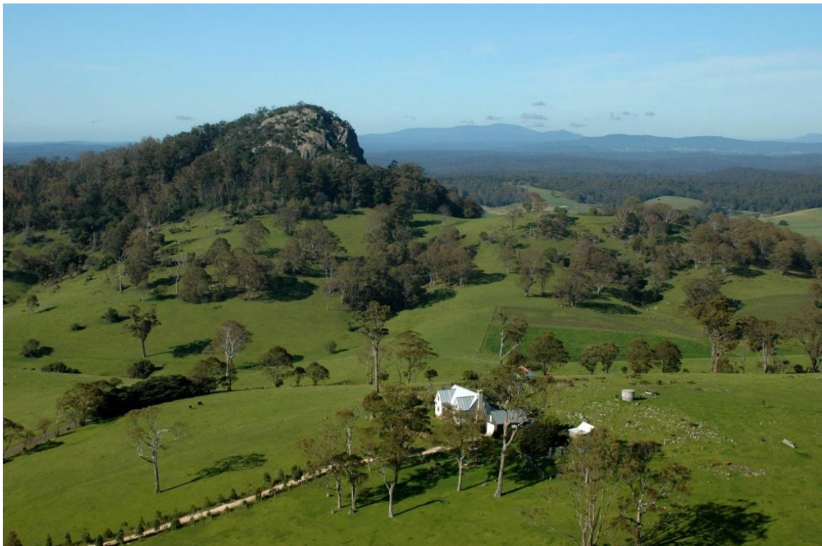
Najanuka (formerly Little Dromedary)

From the 1920s, tourism grew with increasing numbers of visitors from Canberra, Sydney and western NSW attracted by the region's remarkable beauty.