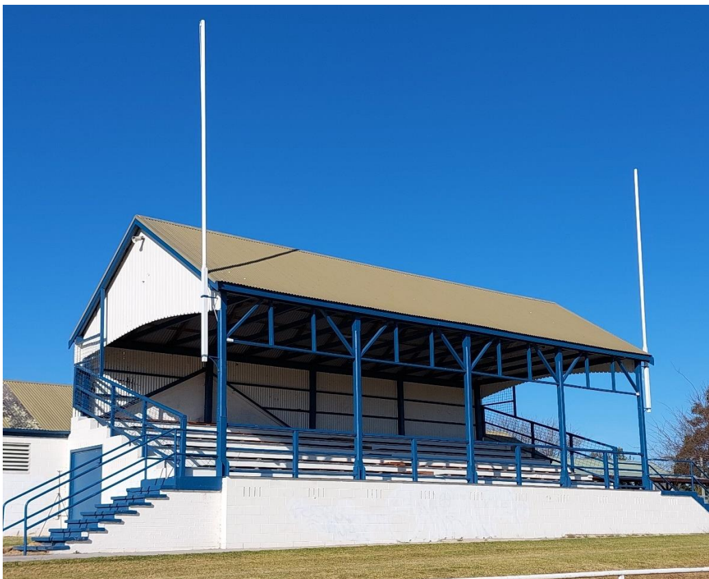
Moruya showground Grandstand, Moruya