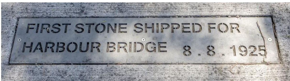
Plaque commemorating first stone shipped for Sydney Harbour Bridge

Note: Implementing the strategy is subject to funding by Council and Heritage NSW.