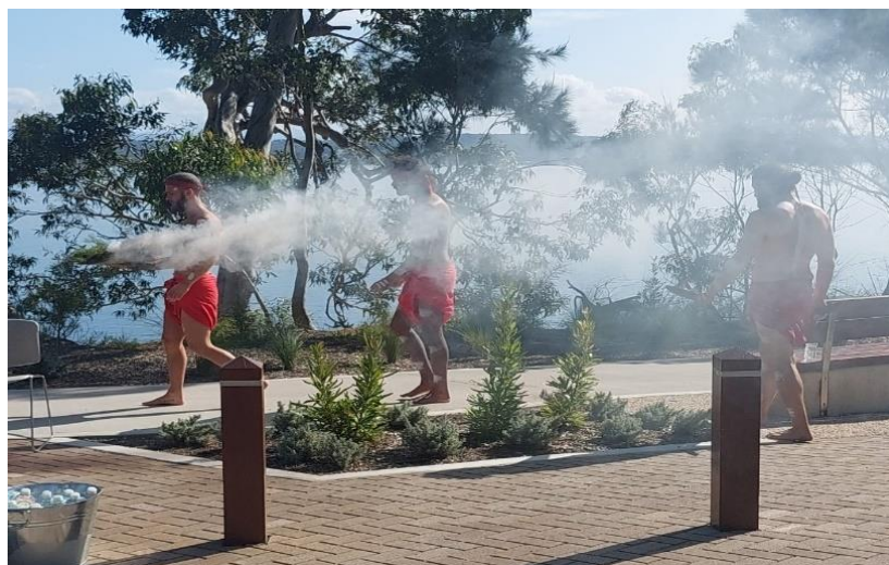
Muladha Gamara dancers