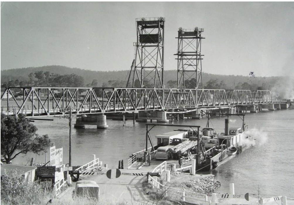
Last Ferry pre bridge opening, Batemans Bay 1956

The strategy will assist in attaining funding and community input to achieve the actions below.