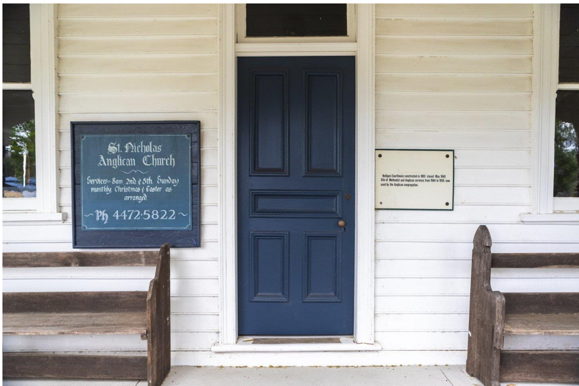
Former Nelligen Court House entrance, Nelligen

Council can achieve the community's vision through implementing its four-year delivery program and one-year operational plan which identifies the management and promotion of the shire's heritage as an activity within the Delivery Programme.