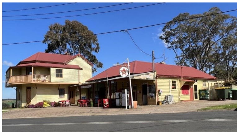
Central Tilba General Store , Central Tilba

General Heritage Management $8,000 per annum – includes Historical Society Support payments