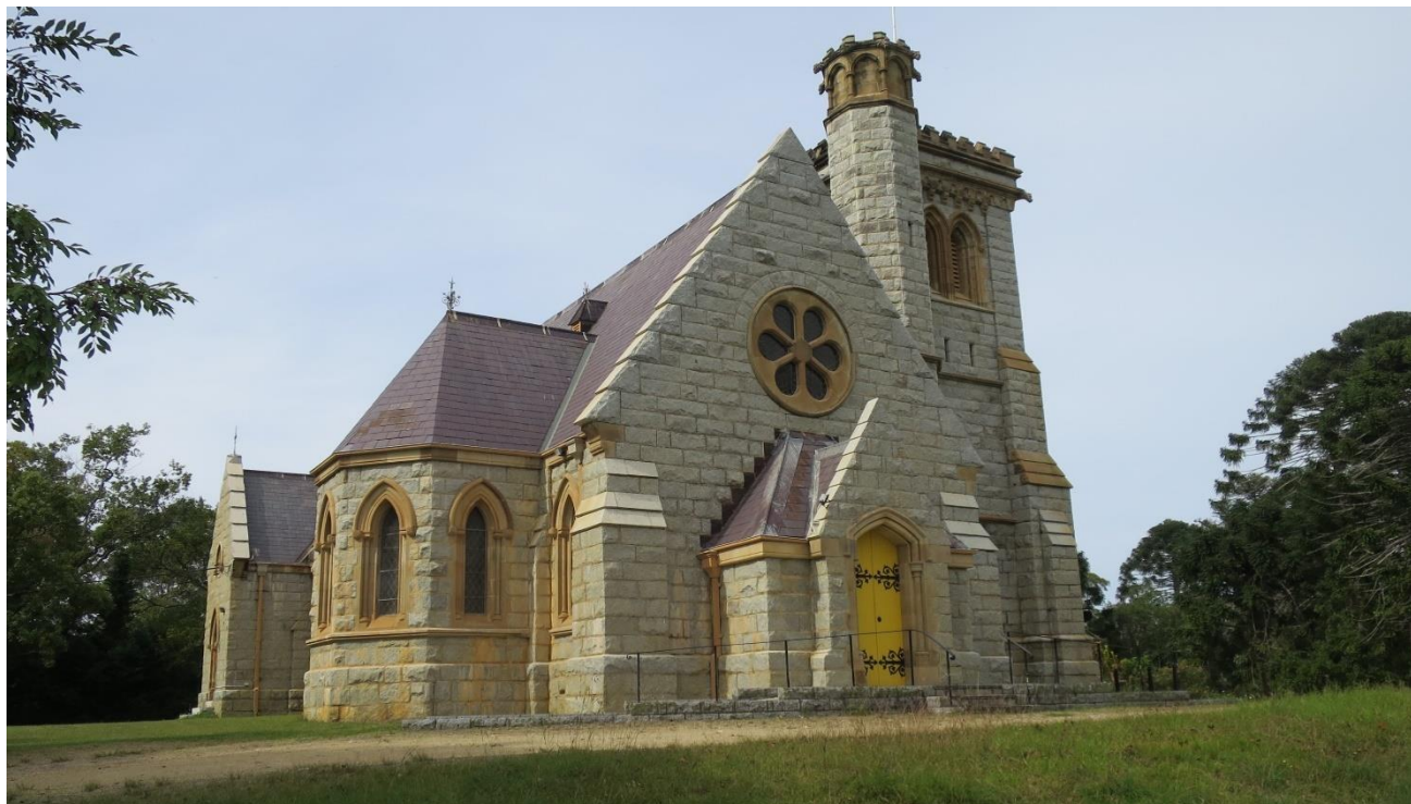
State Heritage listed - All Saints Church, Bodalla

All heritage studies are available under Heritage studies and projects | Eurobodalla Council (nsw.gov.au)