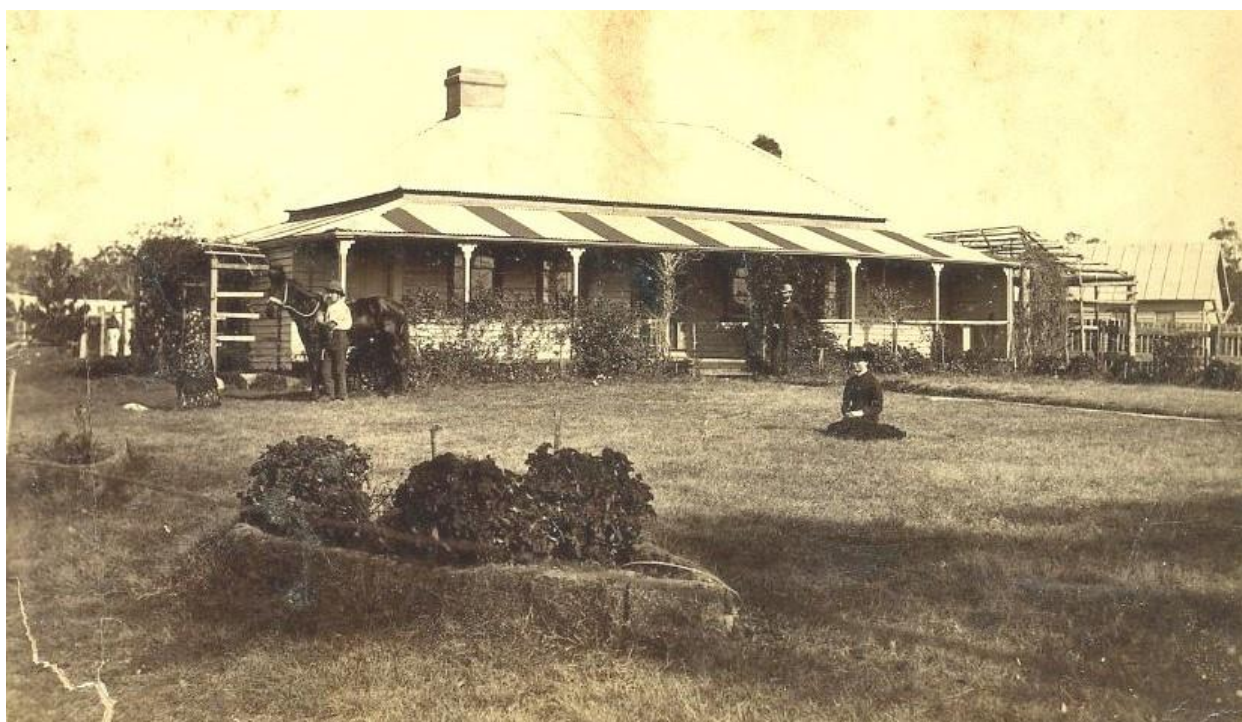
Former Braemar Homestead, Moruya

Heritage is evidence of both our Aboriginal and non-Aboriginal history. Conserving our cultural and environmental heritage helps us understand our past and contribute to the lives of future generations. It gives us a sense of continuity and belonging to the place where we live. Tangible heritage includes buildings, objects, monuments, Aboriginal places, gardens, bridges, natural landscapes, archaeological sites, shipwrecks, relics, streets, industrial structures and conservation precincts. 1 Intangible aspects of cultural heritage includes practices, stories, skills and cultural spaces.