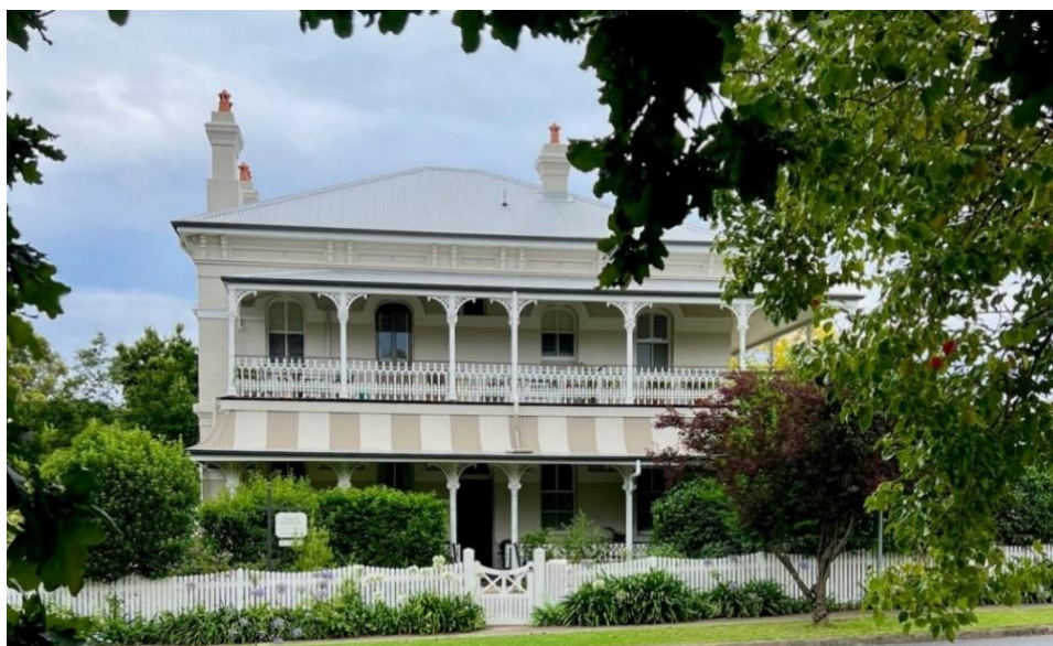
Local Heritage Grant Recipient - Post and Telegraph Building, Moruya

Local Heritage Grants fund is $25,500 per annum - ESC $19,000 + Heritage NSW $6,500