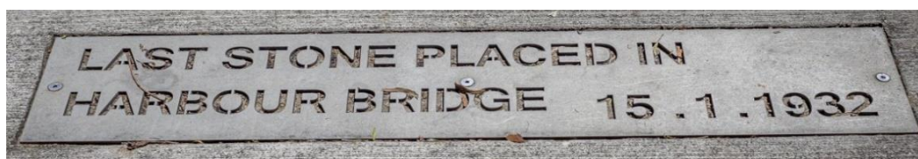
Plaque commemorating last stone placed in Sydney Harbour Bridge

Heritage Advisory Service fund is $20,000 per annum - ESC $14,000 + $6,000 Heritage NSW Museum Advisory Service fund is $14,000 per annum – ESC $7,000 + $7,000 Museum & Galleries NSW