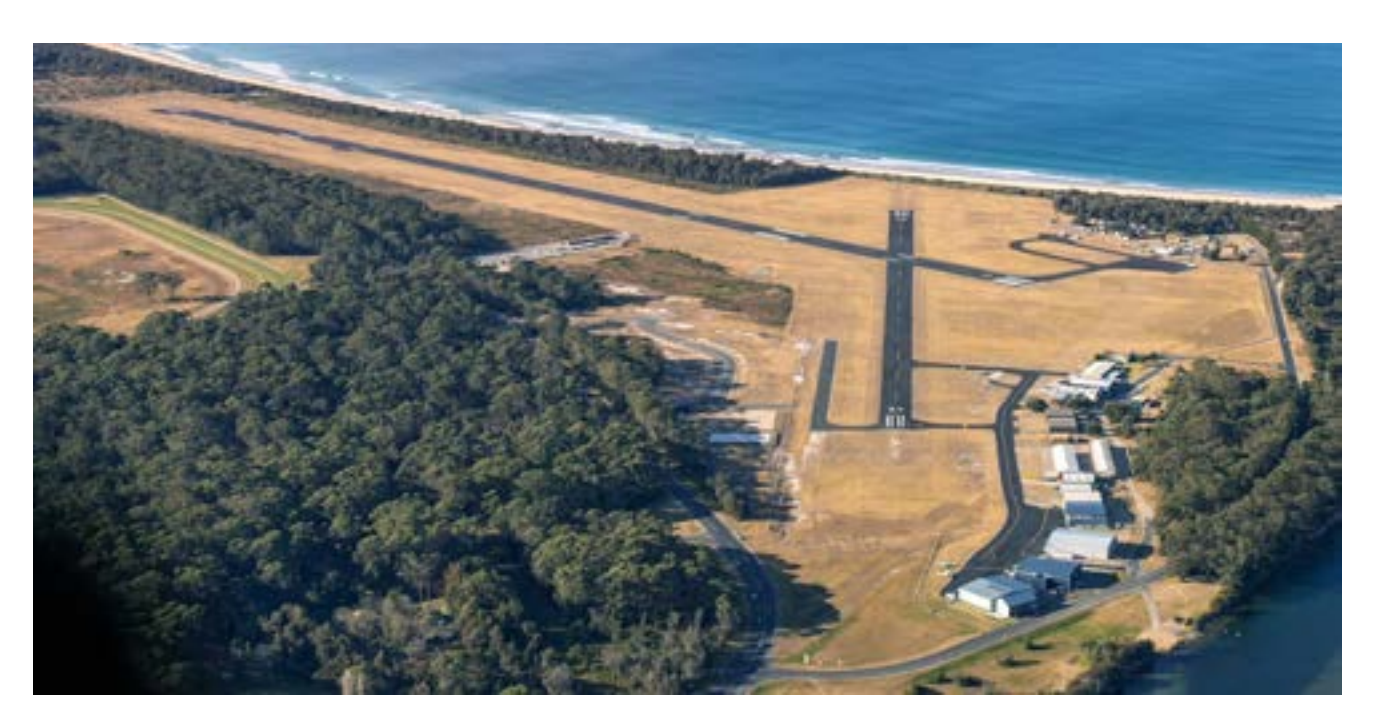
Image: The Council-owned Moruya Airport is a key transport hub for the region.