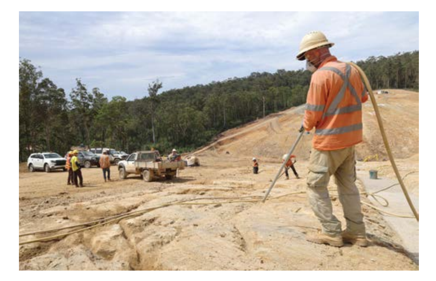
Image: Crews clean out a seam of the new dam wall foundation with high pressure air.