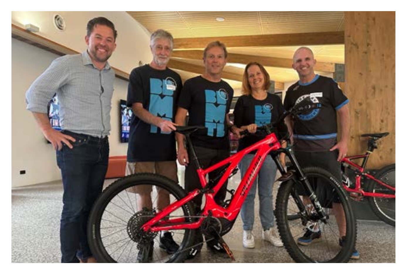
Image: Council's Ride Ready Eurobodalla is an industry development program ahead of the launch of Mogo Trails.