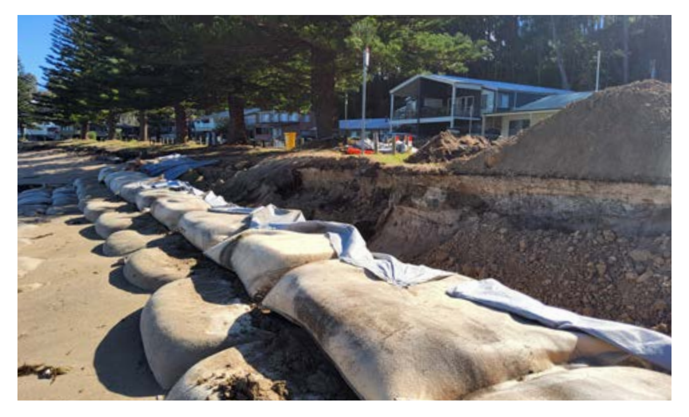
Image: A sandbag structure protects the shoreline at Long Beach, part of the Eurobodalla Open Coastal Management Program