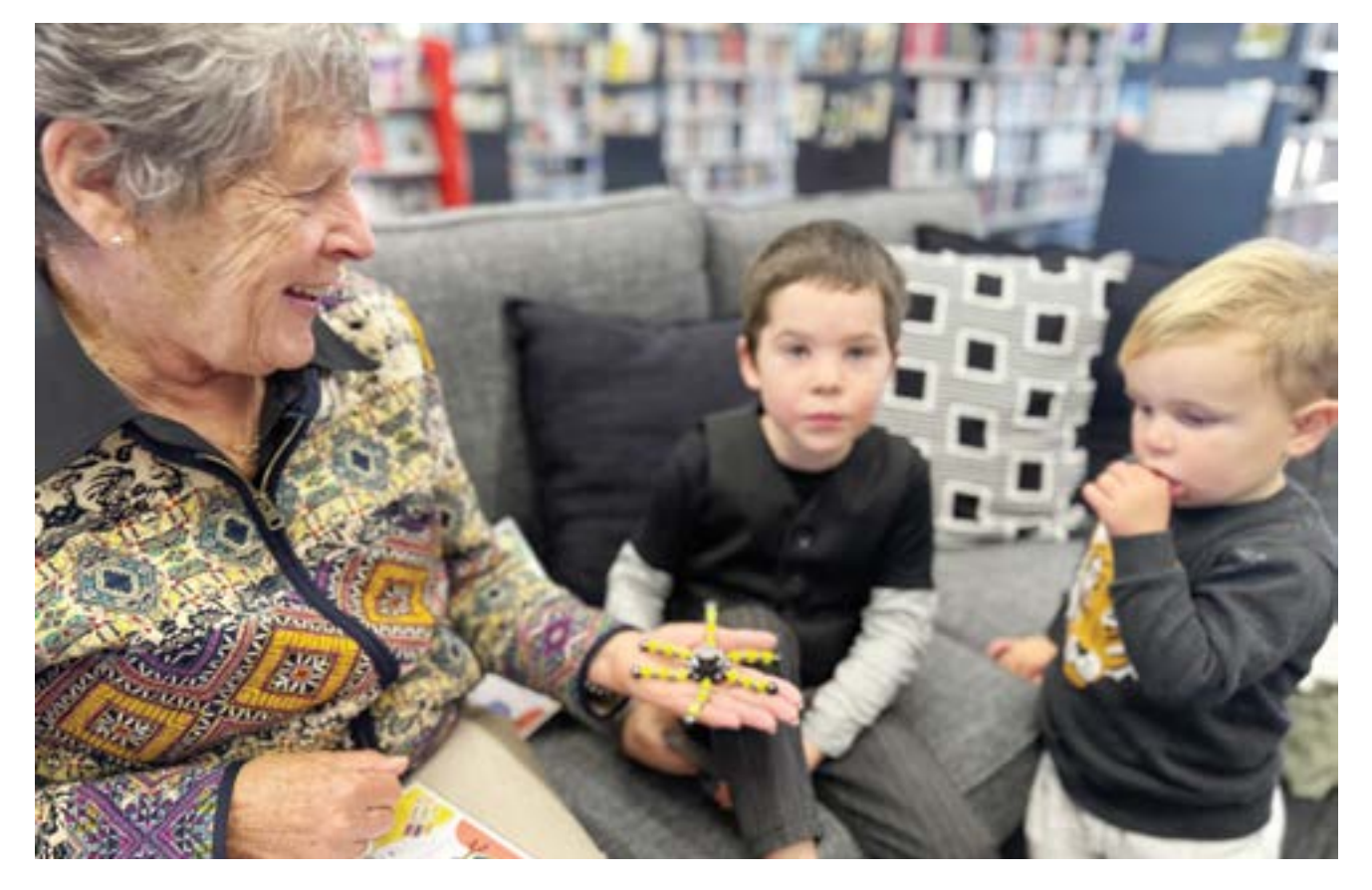
Image: Batemans Bay Library's Intergenerational Playgroup ran for 10 weeks.