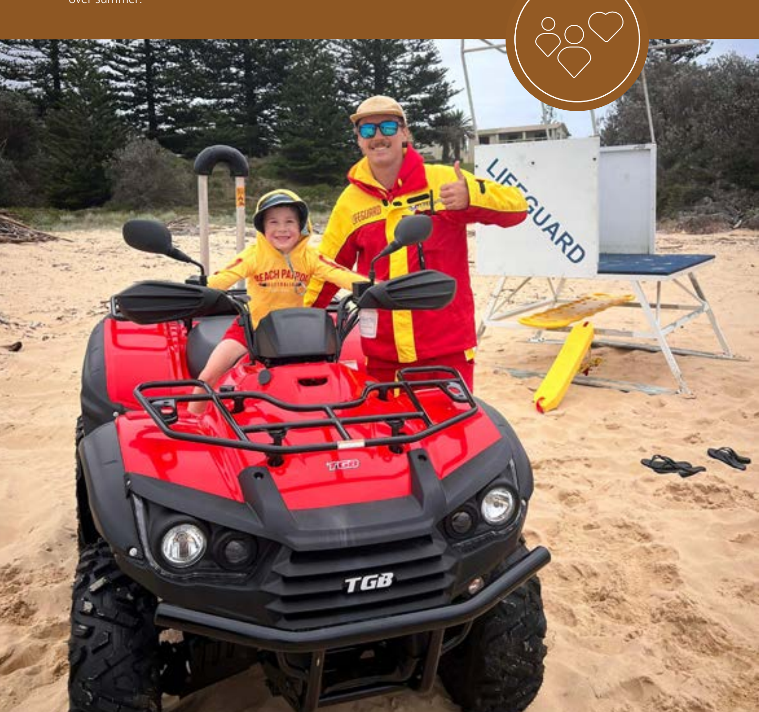
Image: Council's contracted lifeguards keep an eye on the community over summer.