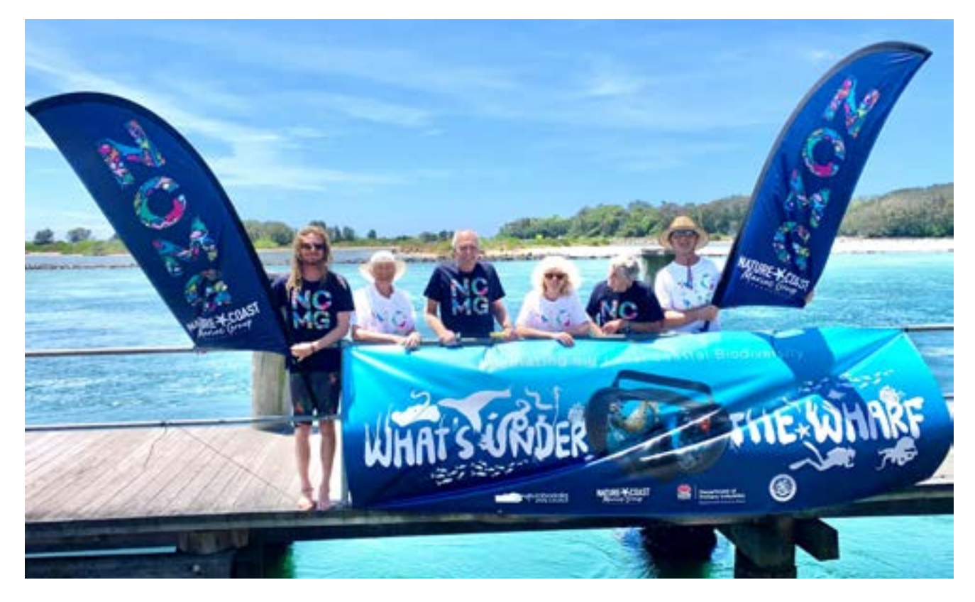
Image: Nature Coast Marine Group teamed up with Council to run What's Under the Wharf at Narooma.