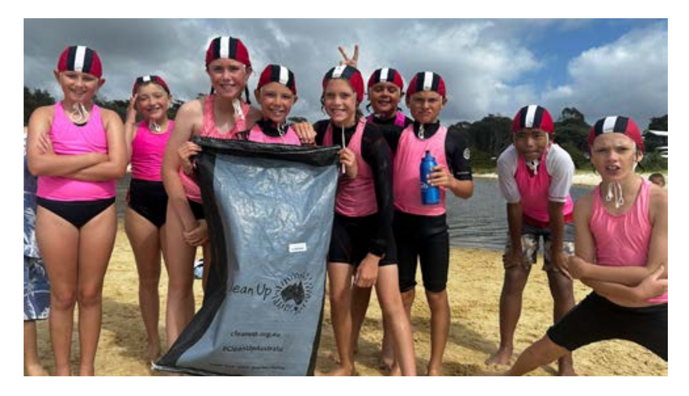
Image: Narooma Nippers were among the 250 volunteers who took part in Clean Up Australia Day 2024.

Number of public and environmental health matters responded to within timeframes