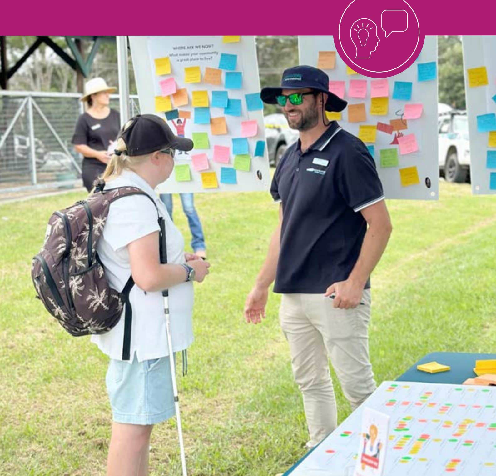
Image: Community members have their say at a pop-up engagement session.