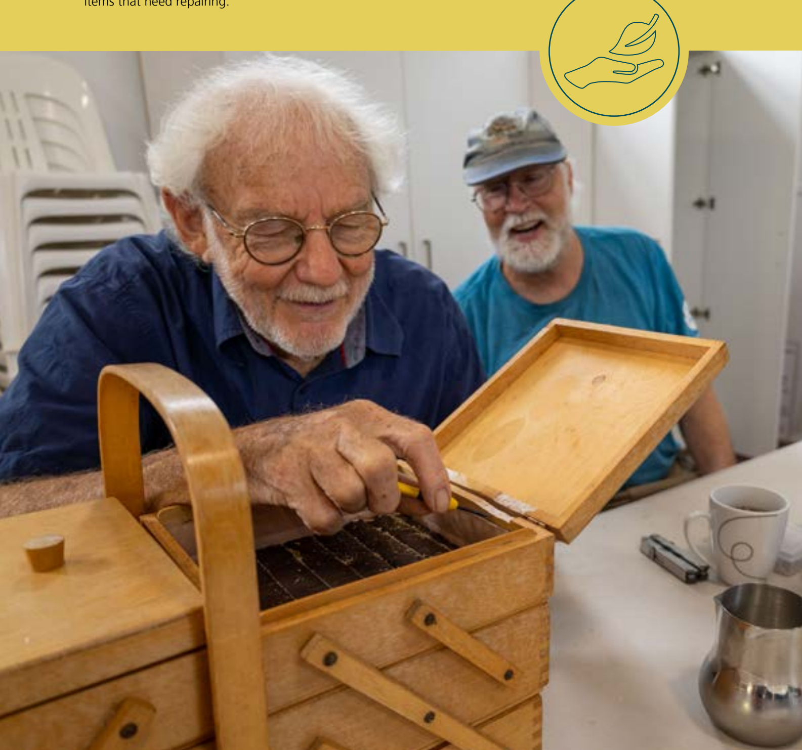
Image: Volunteers of Repair Café Eurobodalla fix the communities household items that need repairing.