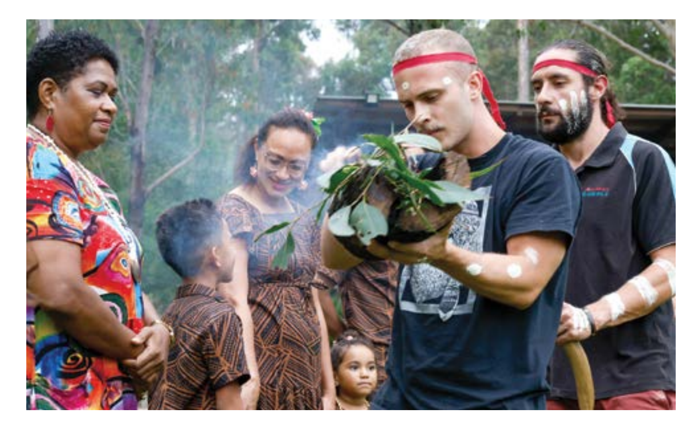
Image: New citizens welcomed at a ceremony held at Eurobodalla Regional Botanic Gardens.