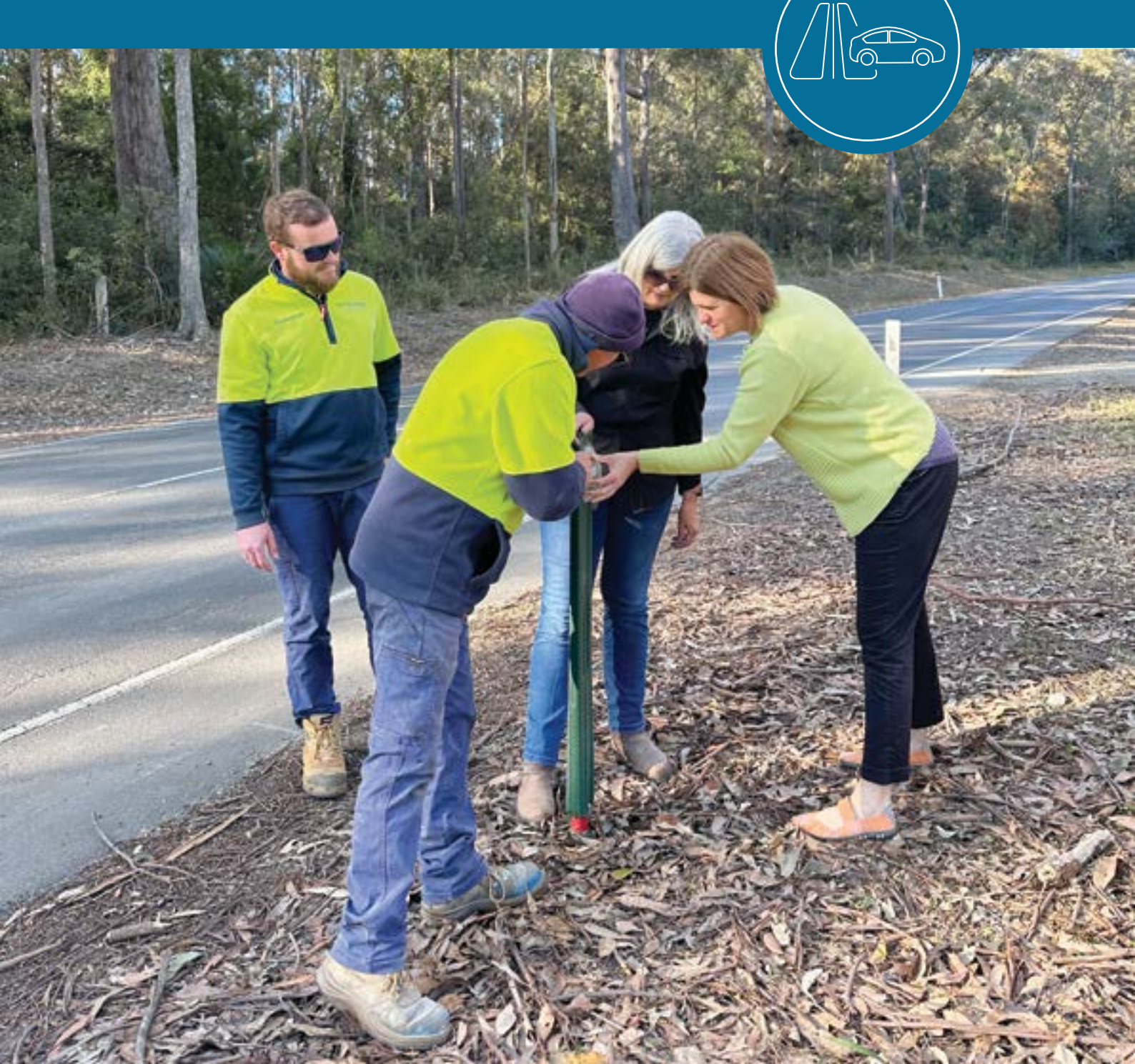
Image: A first for NSW, Eurobodalla's trial of virtual fences was successful with more being installed to reduce wildlife death and injuries.