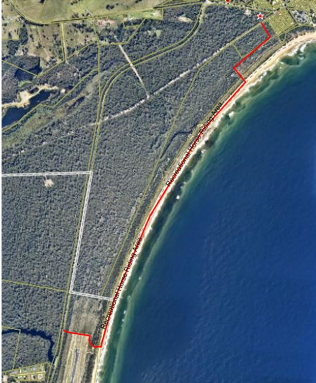
Bengello Beach Broulee, between the sandpit and Moruya airfield windsock