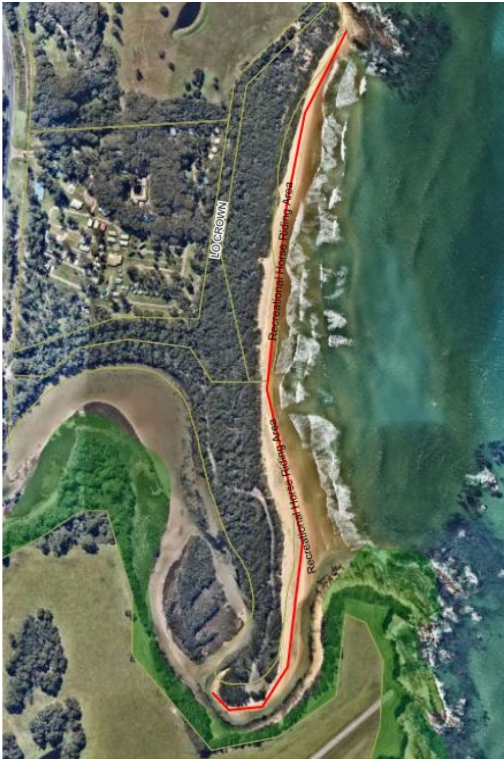
North Nungudga Beach, with access by road only and not along Handkerchief Beach