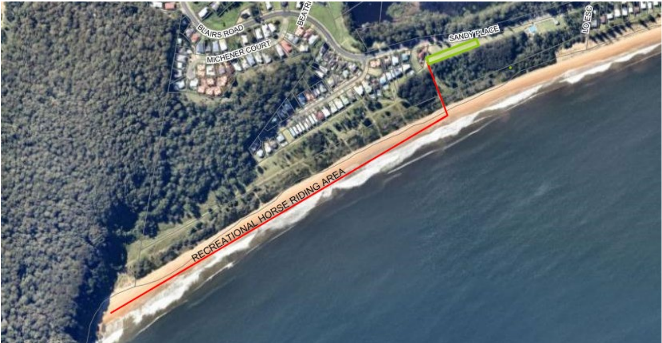
Long Beach recreational horse-riding area from Square Head to the end of Sandy Place