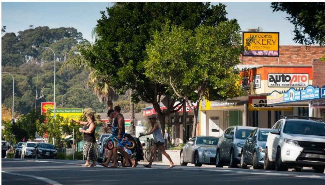
Evolving towns and increases in traffic require retro-fitting of existing road networks to provide for road safety – the Narooma Pedestrian Access Mobility Plan identified the need for traffic lights at the corner of the Princes Highway and Field Street, Narooma

The high cost of road accidents in both trauma and economic terms (estimated at $7.5B in 2016 in NSW), must be addressed. With 45% of these accidents occurring on roads under NSW Council control, the NSW Government must work with all Councils to develop formal Road Safety Plans for each Council area. We recognise the $380,000 offered to IPWEA NSW to train Road Safety Auditors in each Council and applaud this initiative.