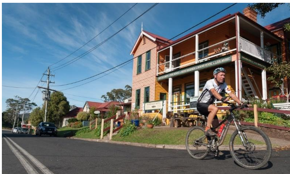
The changing mix of road users brings both benefits and challenges

To provide the basis for future transport across all levels, telecommunications infrastructure must also be developed to provide comparable levels of service to urban (city) levels. The Australian Government has committed to provide four new mobile telephone towers along the Princes Highway and Kings Highway routes within Eurobodalla. We encourage the NSW Government to advocate for the early completion of the vital projects.