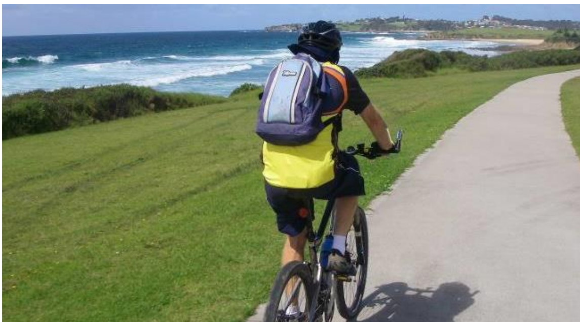
A cyclist enjoying one of our beautiful coastal shared pathways at Dalmeny

The Pathways Strategy recognises the economic benefit pathways provide by connecting pedestrians and cyclists to business activities, accommodation and recreation areas including beaches and popular lookouts.