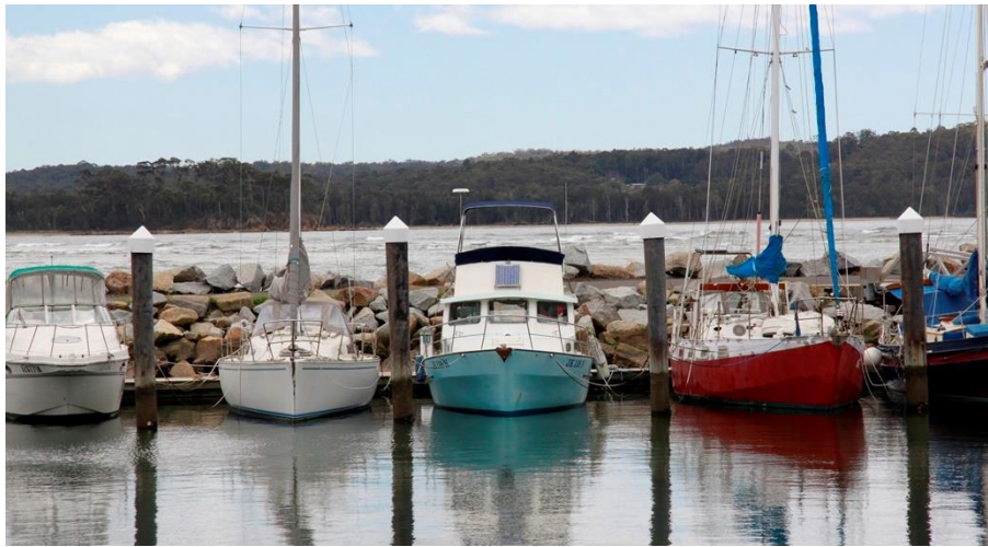
Marine transport has a strong future in Eurobodalla