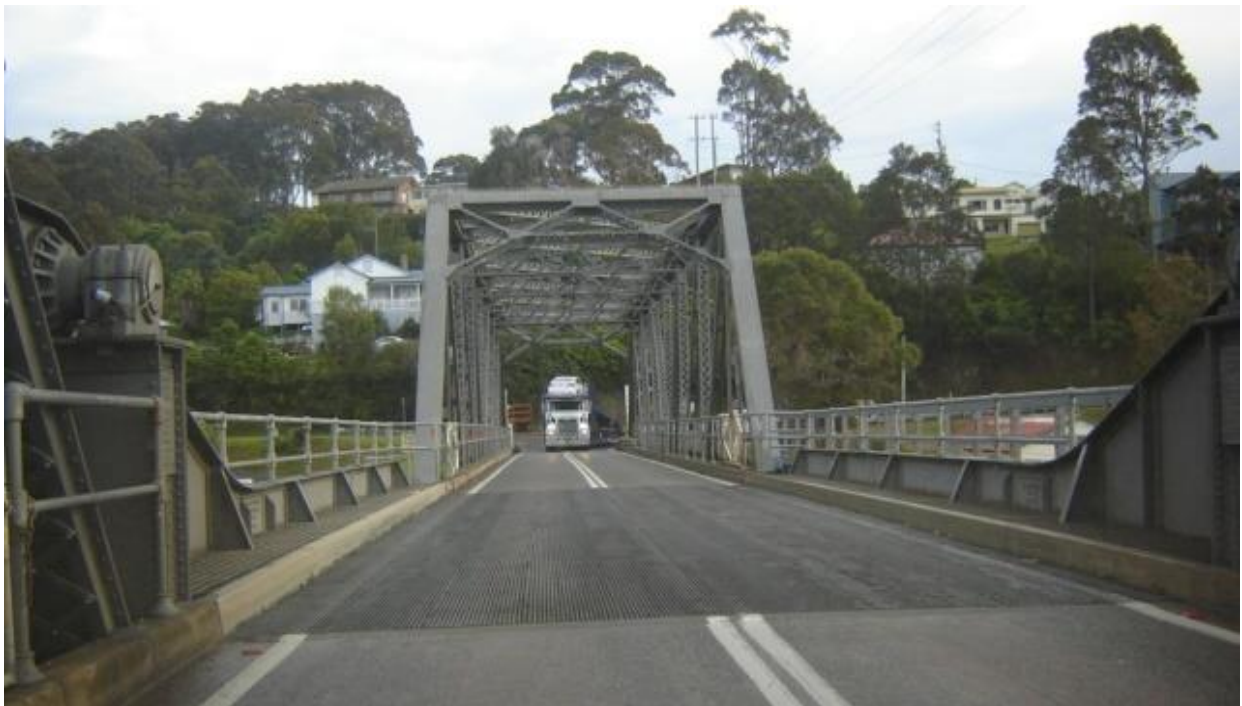
Normal semi-trailers regularly crossing the road centre-line to avoid hitting the bridge pylon

The bridge structure has already been damaged on a number of occasions after being hit by errant vehicles. It is a known risk. There is no acceptable alternate route if the bridge structure were to be damaged and the highway closed to traffic.