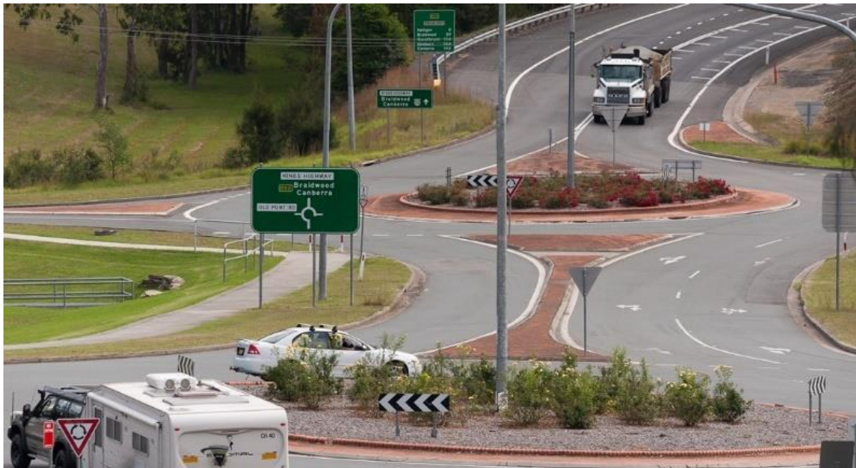
Princes Highway/Kings Highway intersection constrains traffic moving from the west into Batemans Bay with long queues during shoulder and peak periods

To secure the economic and social prosperity of our community in the short and long term, further upgrades and excellent long term infrastructure planning for these highways, backed by the necessary Government funding, is essential.