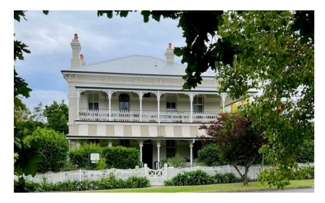
Local Heritage Grant Recipient - Post and Telegraph Building, Moruya

Local Heritage Grants fund is $25,500 per annum - ESC $19,000 + Heritage NSW $6,500