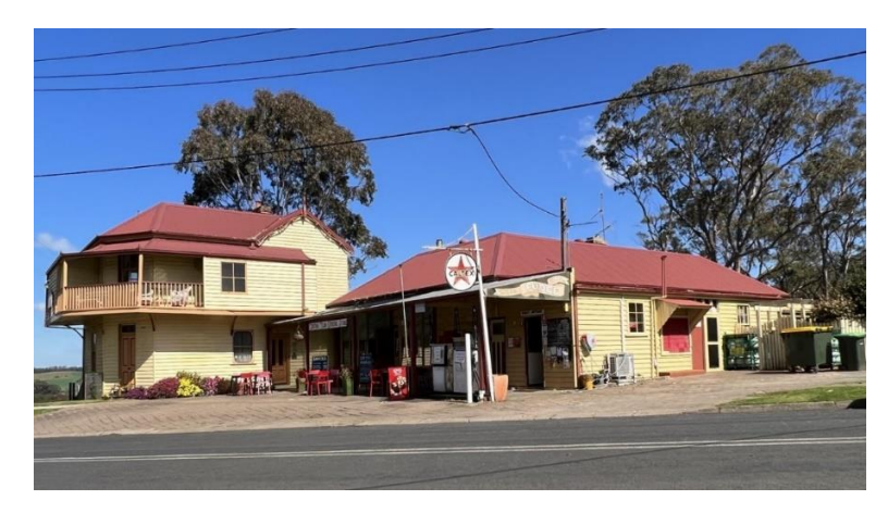
Central Tilba General Store , Central Tilba

General Heritage Management $8,000 per annum – includes Historical Society Support payments