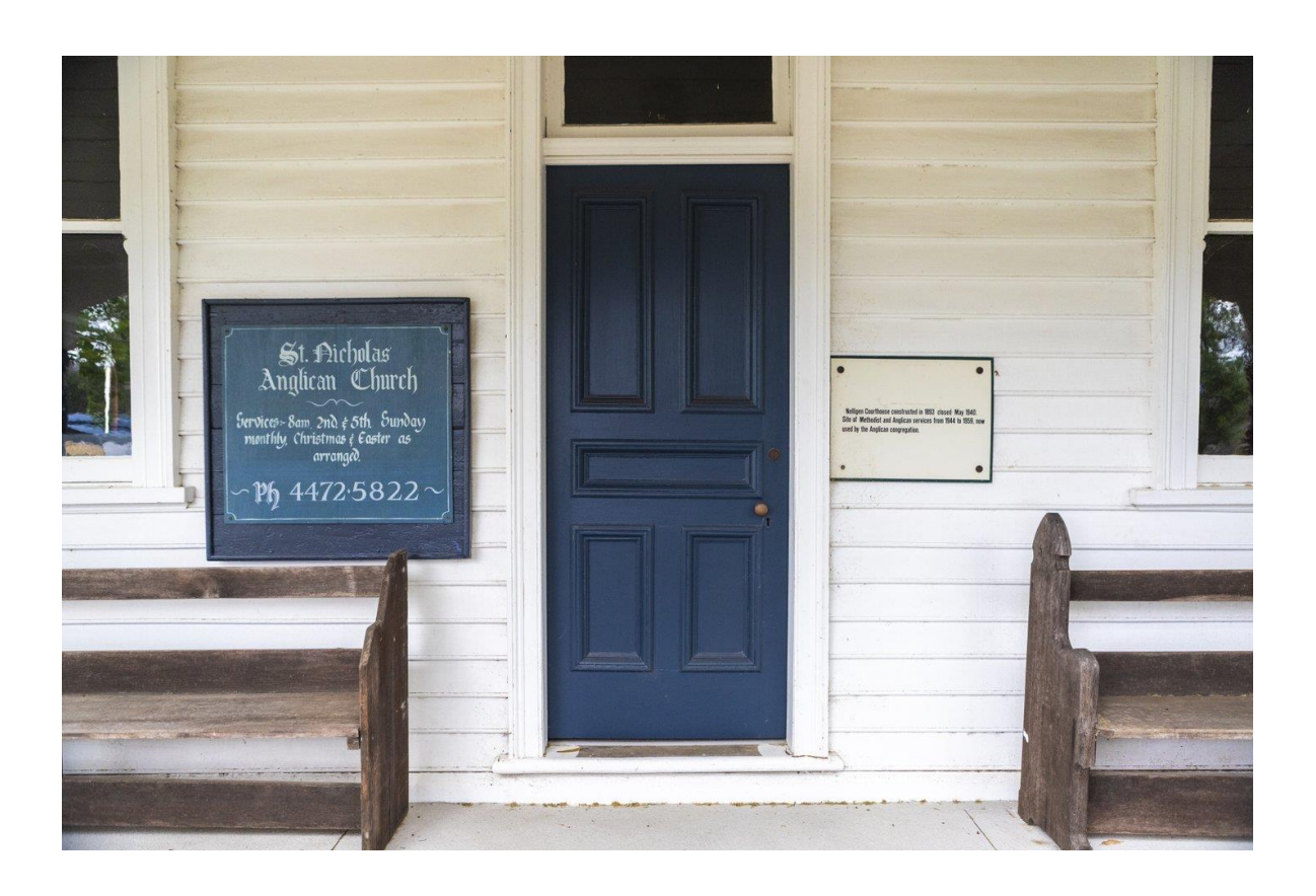
Former Nelligen Court House entrance, Nelligen

Council can achieve the community's vision through implementing its four-year delivery program and one-year operational plan which identifies the management and promotion of the shire's heritage as an activity within the Delivery Programme.