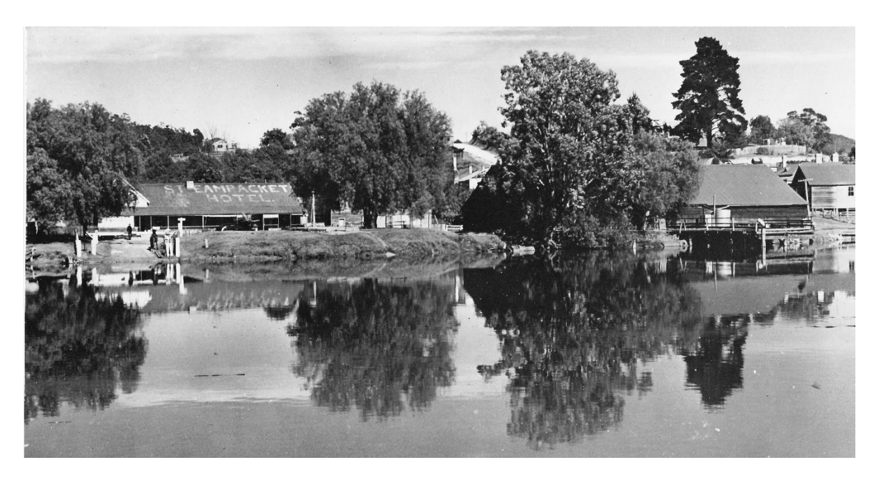
Old Steampacket Hotel, Nelligen circa 1925