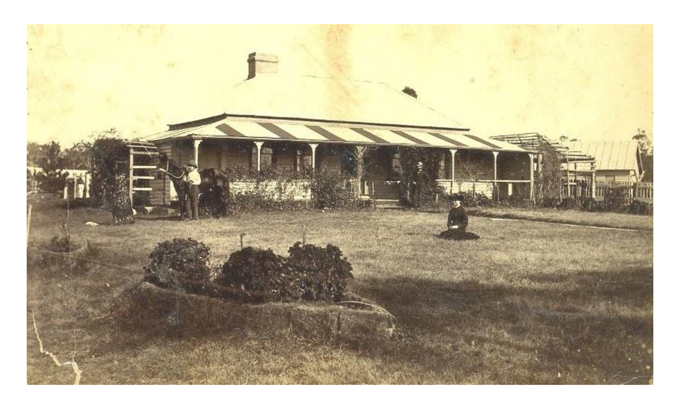
Former Braemar Homestead, Moruya

Heritage is evidence of both our Aboriginal and non-Aboriginal history. Conserving our cultural and environmental heritage helps us understand our past and contribute to the lives of future generations. It gives us a sense of continuity and belonging to the place where we live. Tangible heritage includes buildings, objects, monuments, Aboriginal places, gardens, bridges, natural landscapes, archaeological sites, shipwrecks, relics, streets, industrial structures and conservation precincts. Intangible aspects of cultural heritage includes practices, stories, skills and cultural spaces.