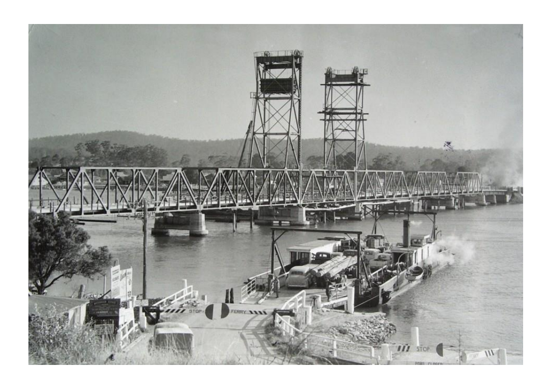
Last Ferry pre bridge opening, Batemans Bay 1956

The strategy will assist in attaining funding and community input to achieve the actions below.