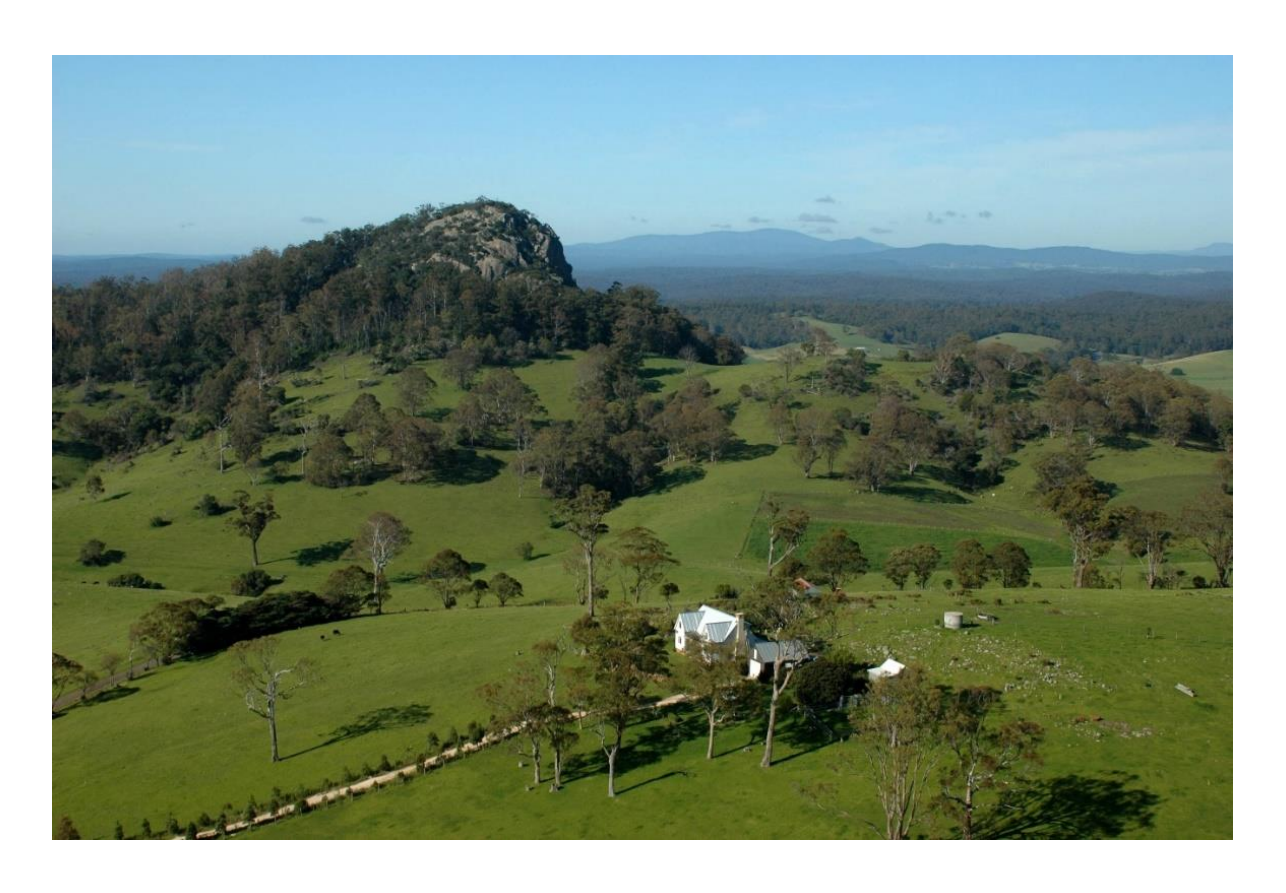
Najanuka (formerly Little Dromedary)

From the 1920s, tourism grew with increasing numbers of visitors from Canberra, Sydney and western NSW attracted by the region's remarkable beauty.