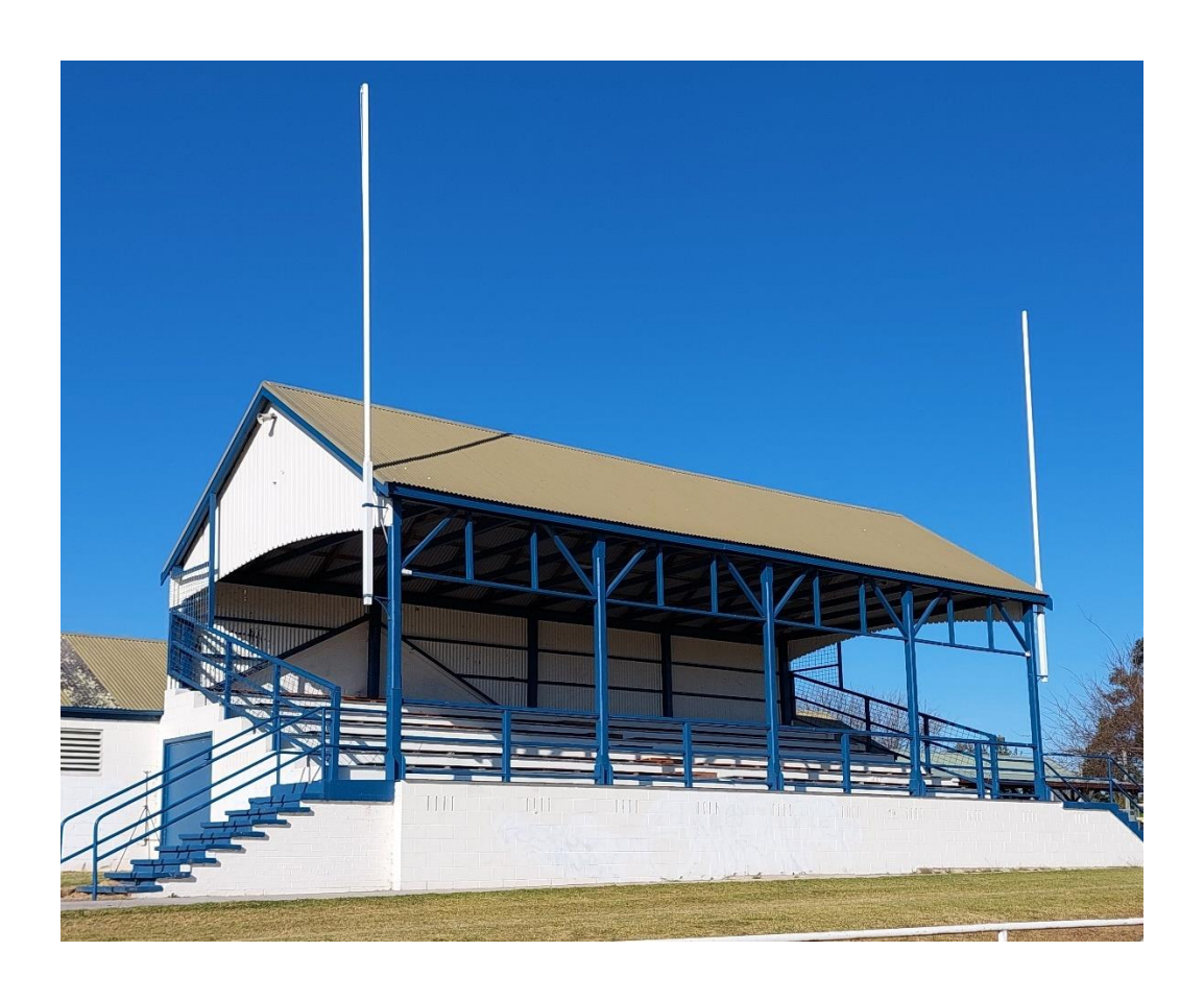
Moruya showground Grandstand, Moruya