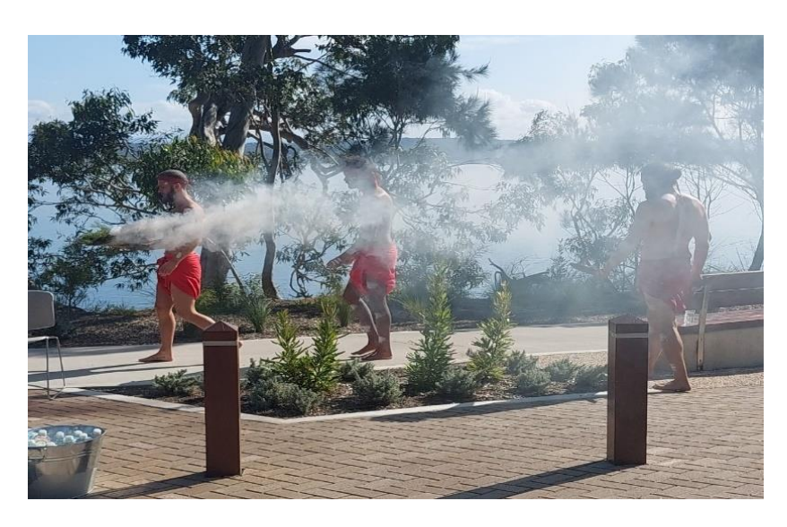
Muladha Gamara dancers