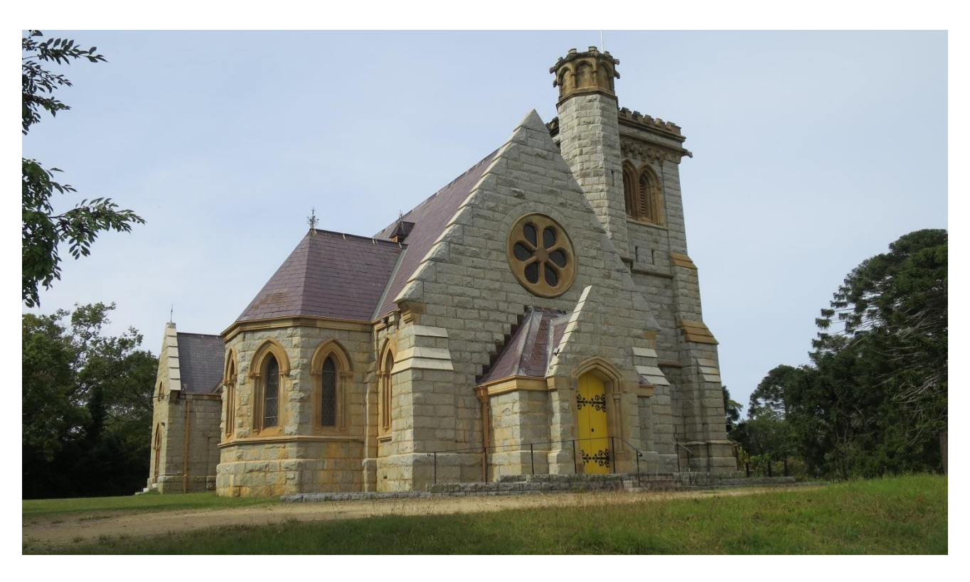
State Heritage listed - All Saints Church, Bodalla

All heritage studies are available under <u>Heritage studies and projects | Eurobodalla Council (nsw.gov.au)</u>