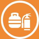
Gas bottles and fire extinguishers