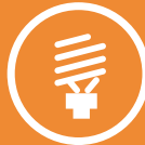
Fluoro globes and tubes